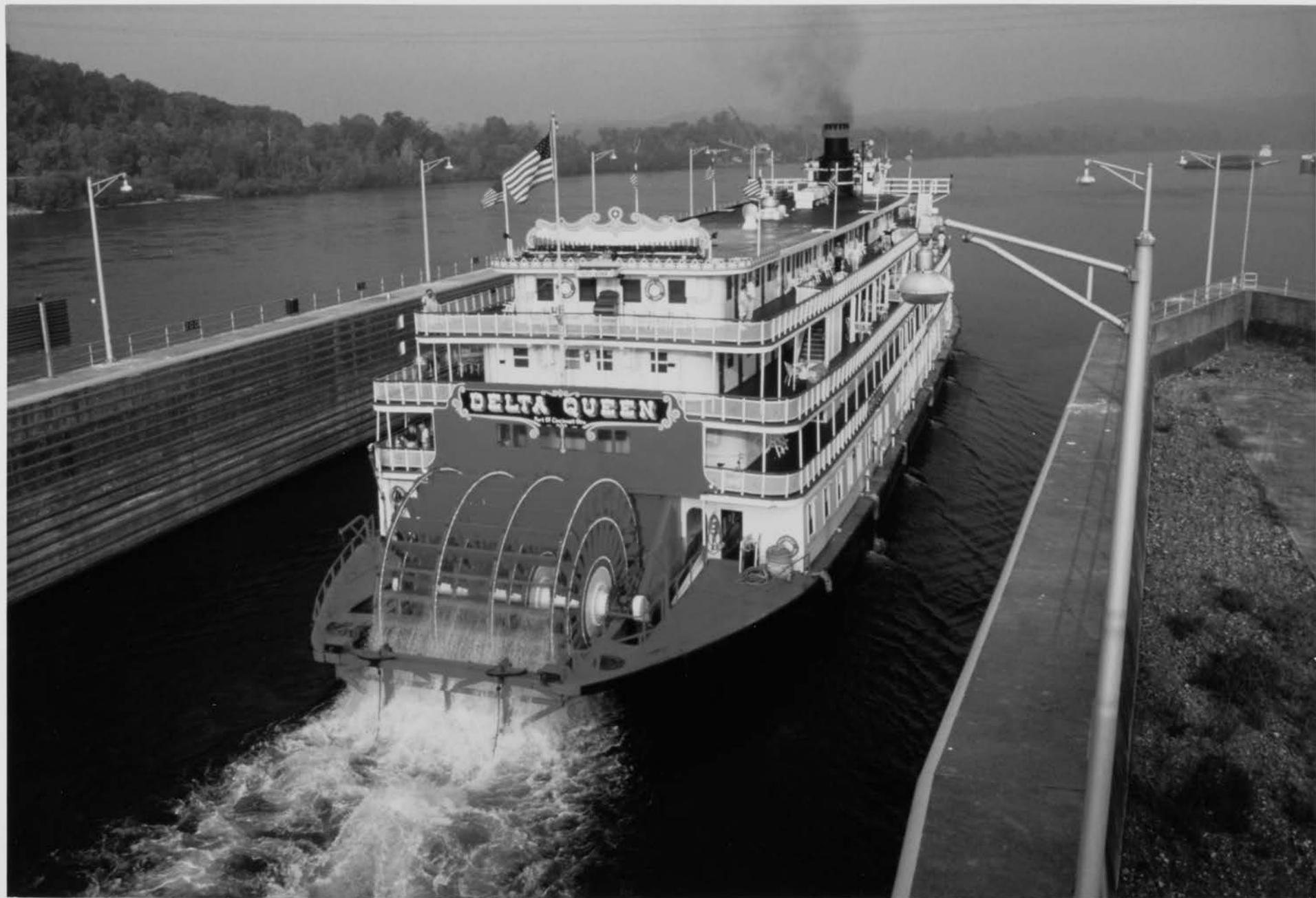
The National Historic Landmark DELTA QUEEN gently rolls out of an Ohio River lock. The Legendary DELTA QUEEN, like her sister steamboats, the AMERICAN QUEEN and MISSISSIPPI QUEEN, provides luxurious river passage in grand Victorian style, visiting quaint river towns and discovering grand American traditions along the way.