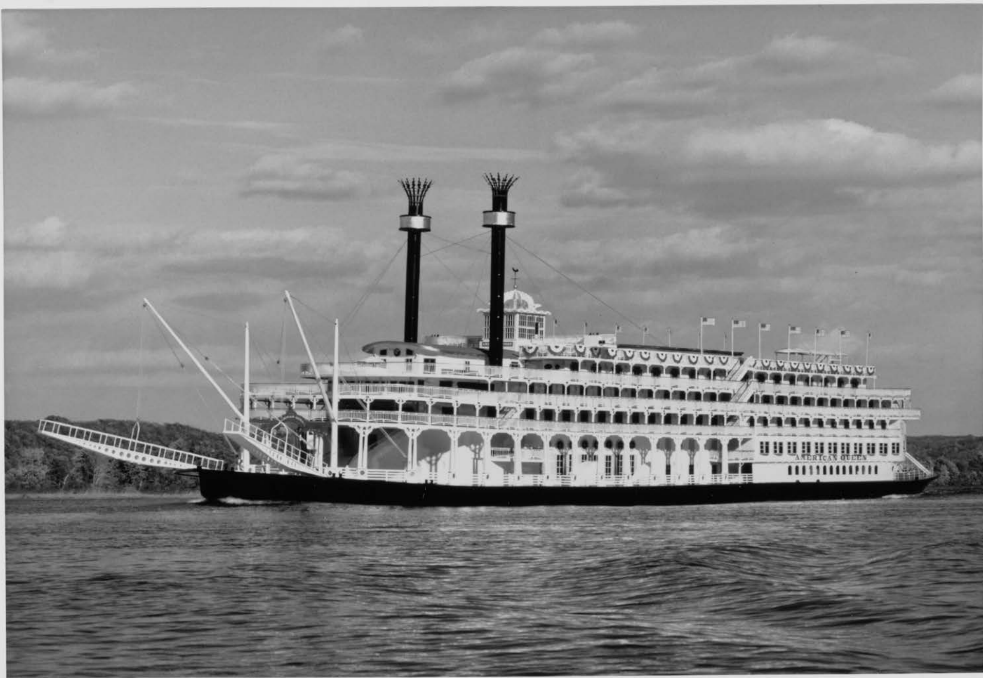
The Delta Queen Steamboat Co.'s grand new paddlewheeler, the American Queen , is the latest in a long line of palatial steamboats owned and operated by the 105-year old company. The $65 million American Queen , scheduled to begin service on June 27, 1995, is the culmination of almost two centuries of Steamboatin' design and tradition.