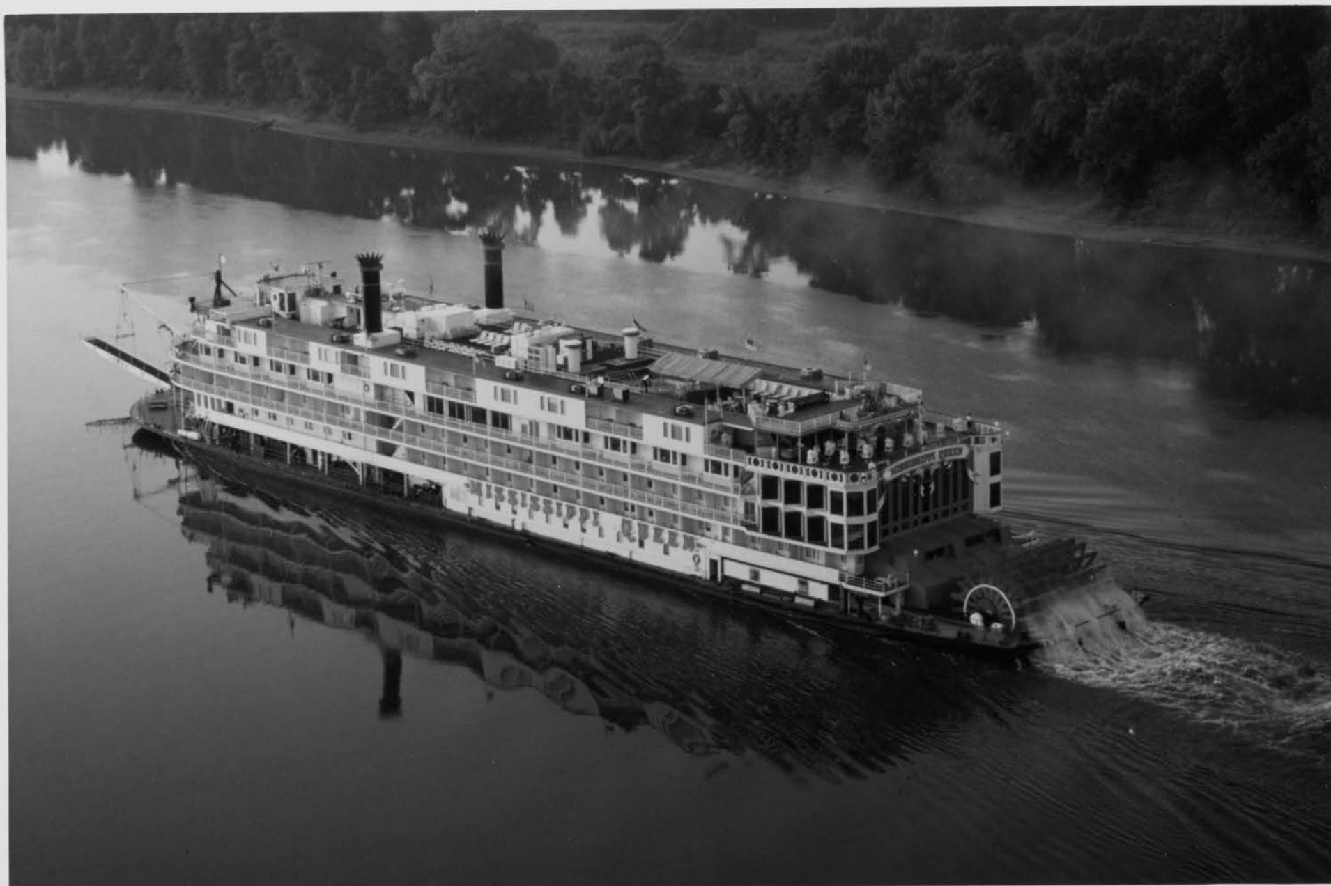
QUEEN OF THE MISSISSIPPI -- Built in 1976, the MISSISSIPPI QUEEN was inspired by Mark Twain's famous quote -- "Someday, they'll build the biggest steamboat the world has ever known; and she'll be long, white and gleaming in the sunshine with her twin black stacks. And that one shall be the Queen of the Mississippi." The Delta Queen Steamboat Co.'s AMERICAN QUEEN will further embody Twain's image of the grand river palaces.