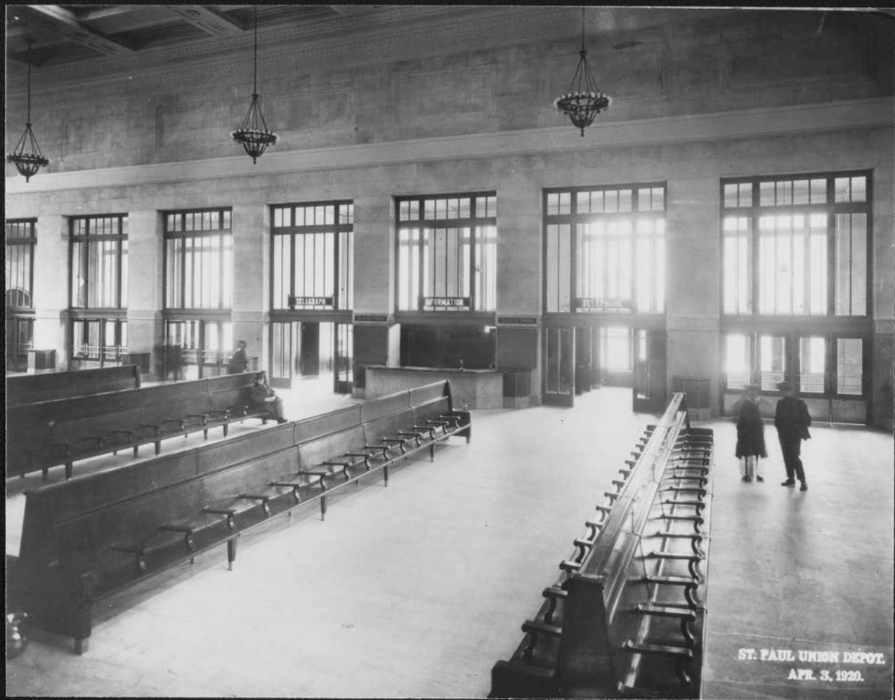
ST. PAUL UNION DEPOT. APR. 3, 1920.