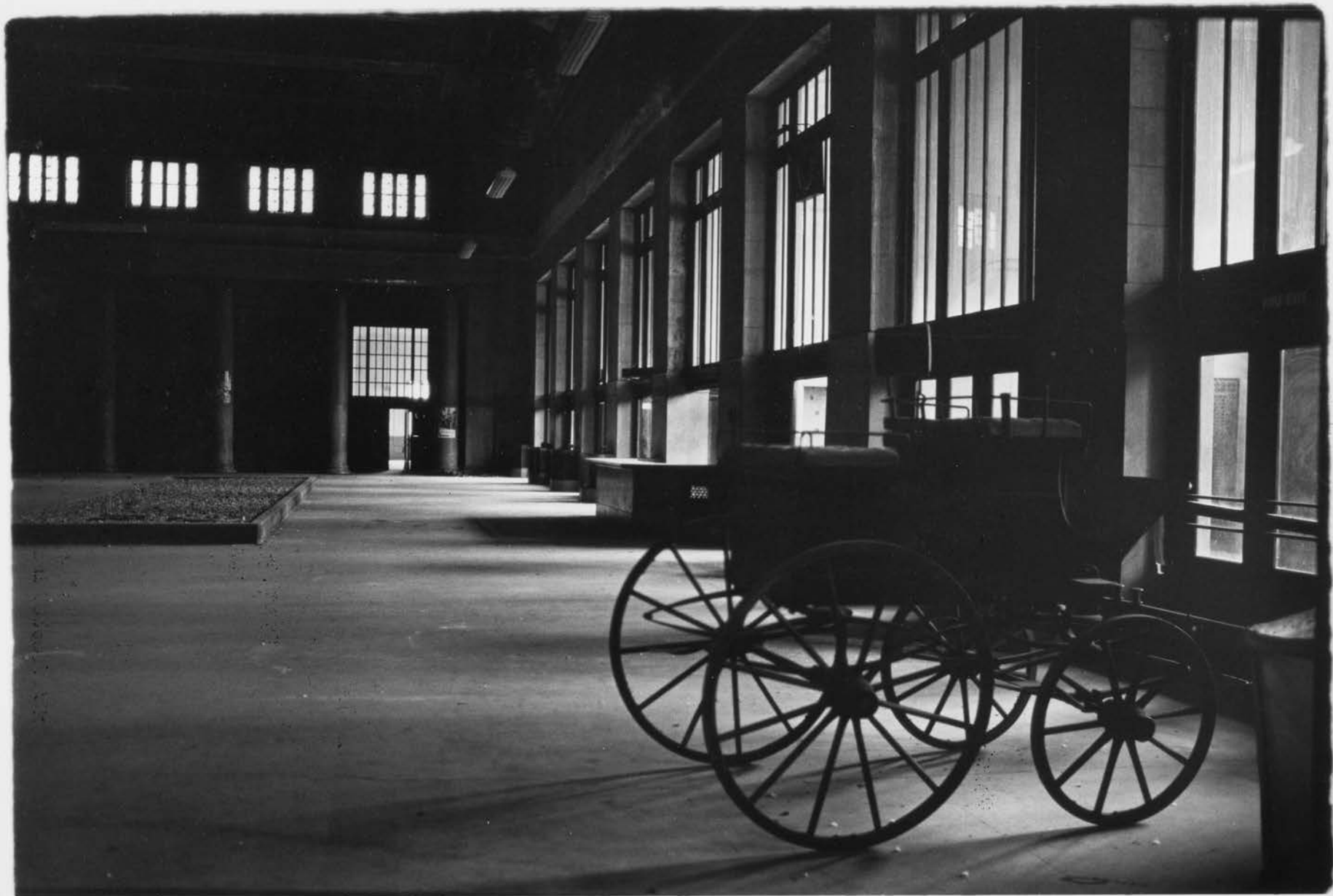
Union Depot, before renovation