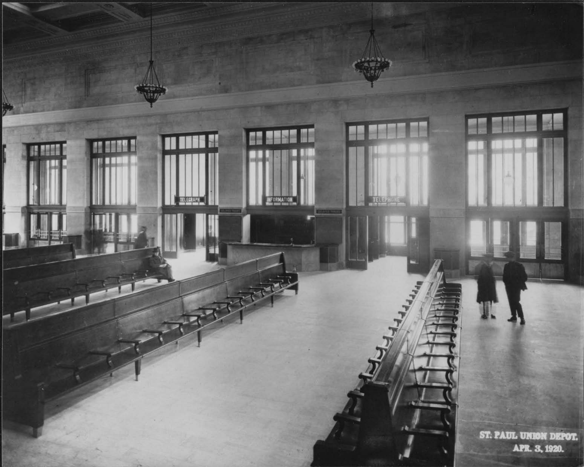
ST. PAUL UNION DEPOT. APR. 3, 1920.