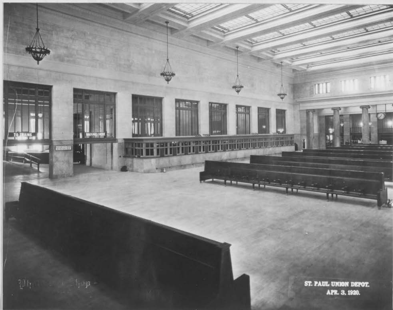
ST. PAUL UNION DEPOT. APR. 3, 1920.