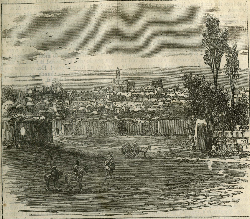
THE CITY OF KHIVA.