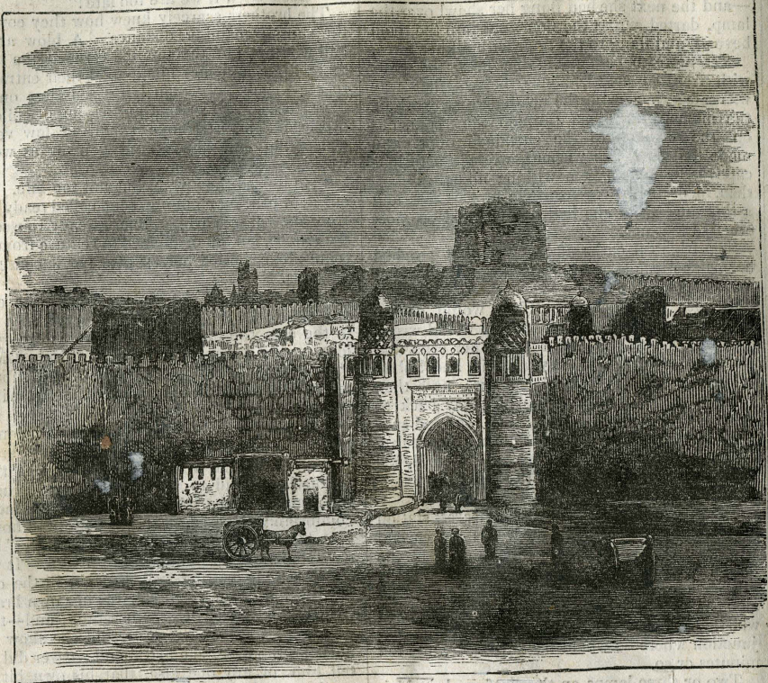
THE KHAN'S PALACE.