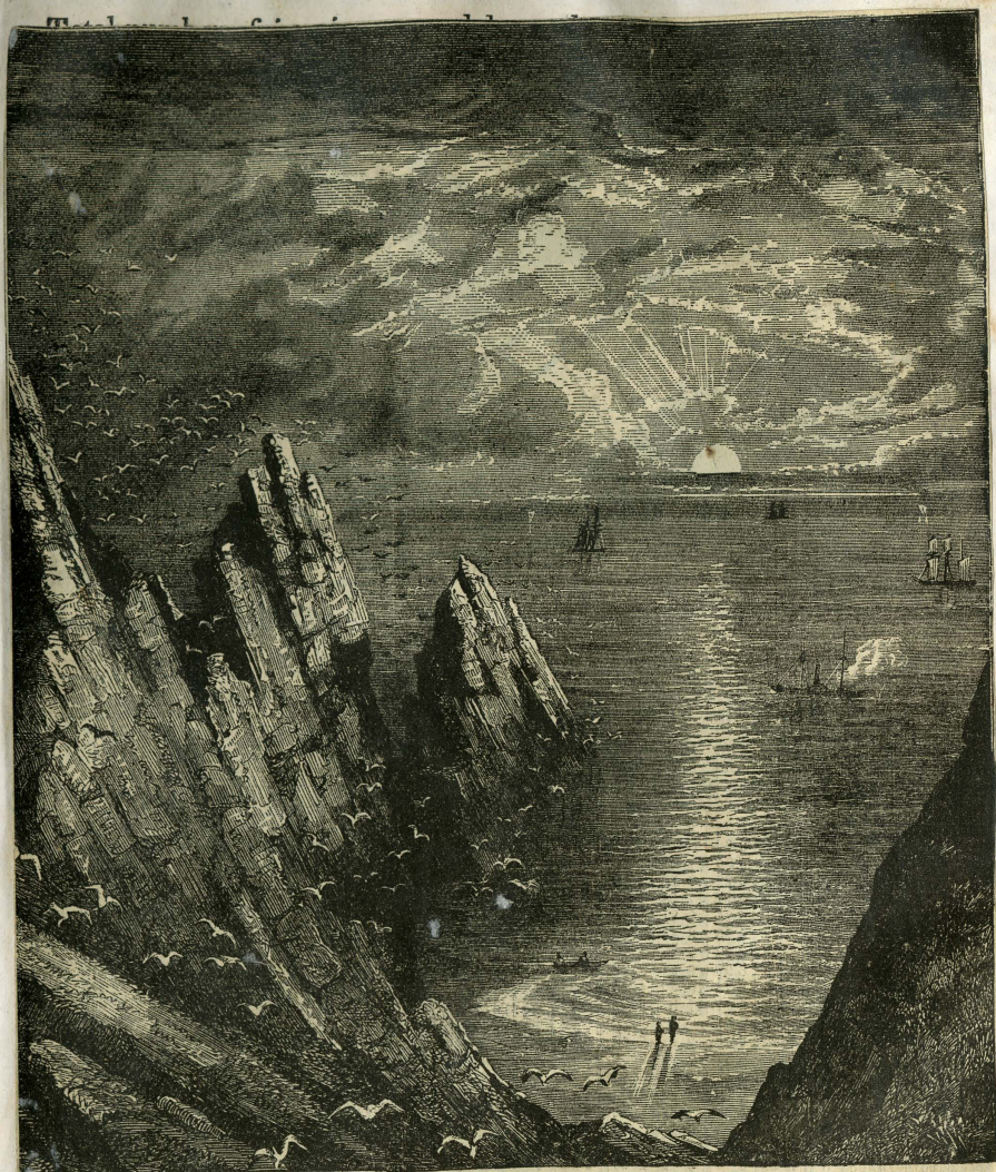
THE HOME OF THE SEA-BIRDS.