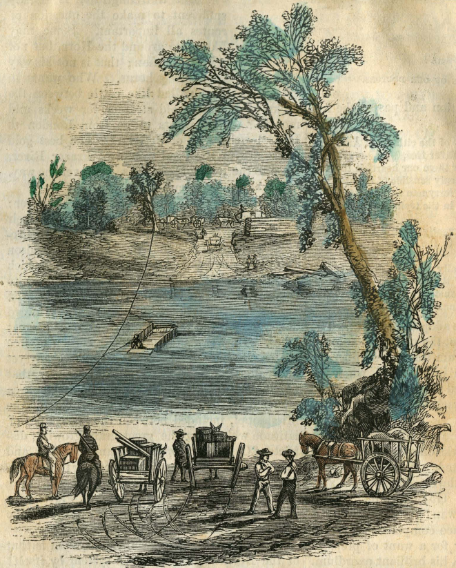
FERRY OVER RUM RIVER.