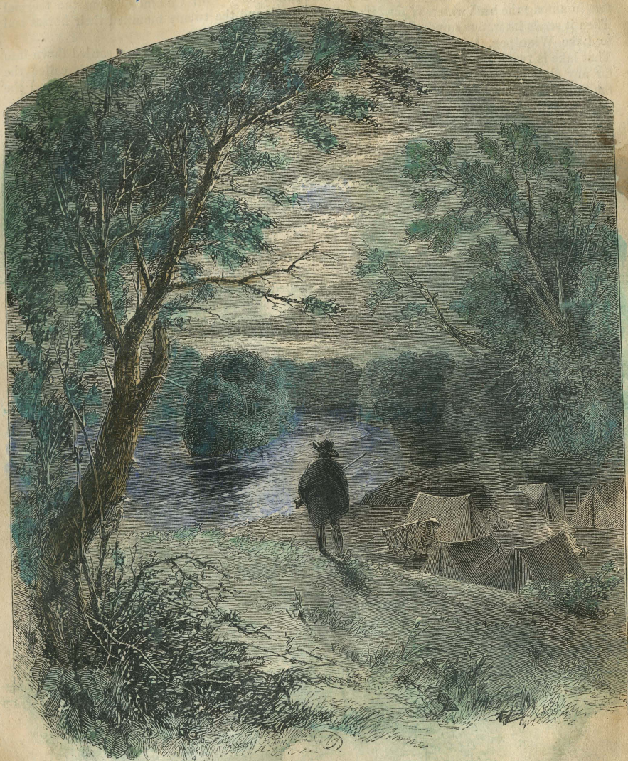
MY FIRST WATCH.