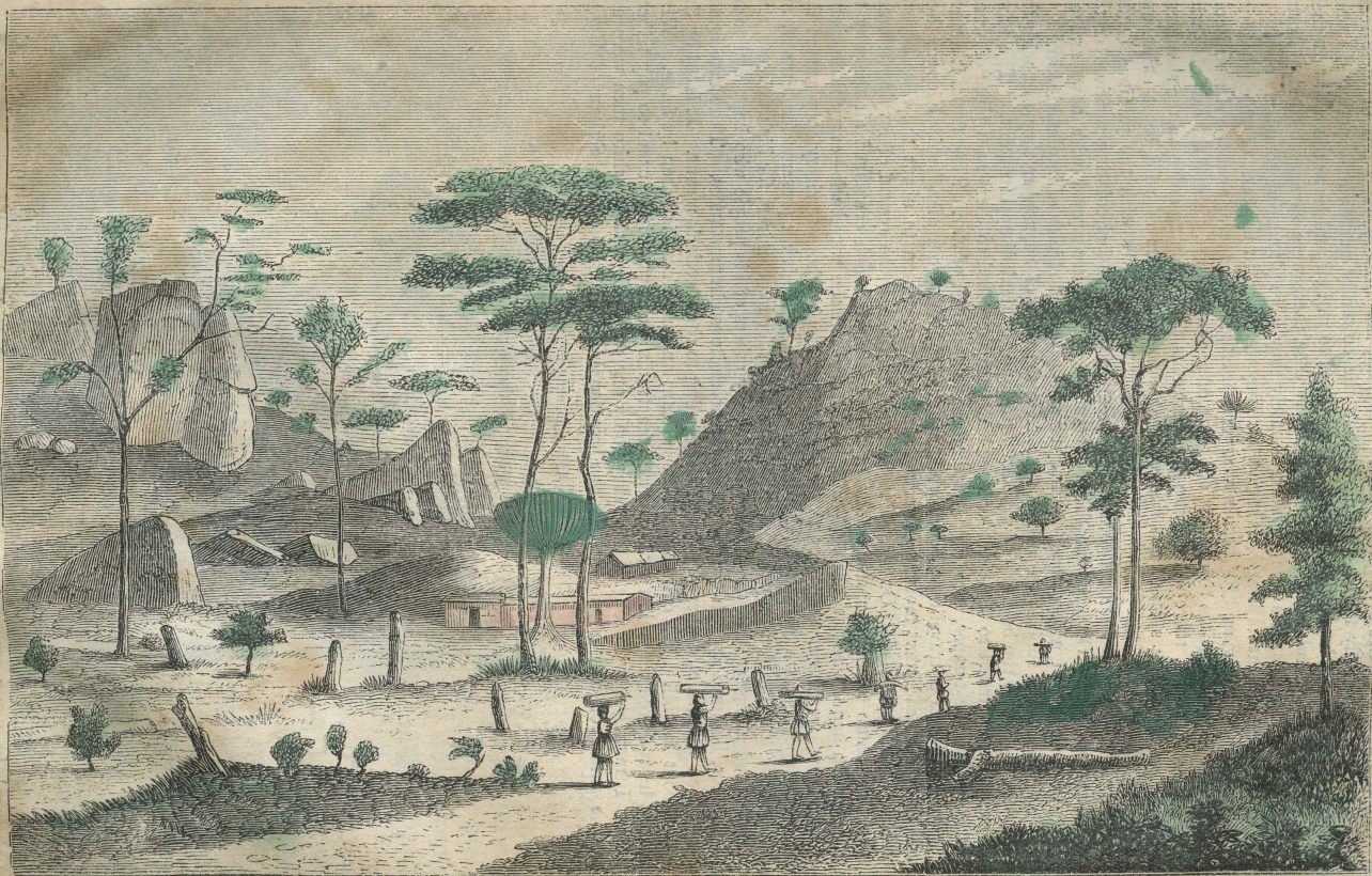
VIEW IN UNYAMWEZI.

years was 559,053. It is presumed the greatest increase has occurred in the