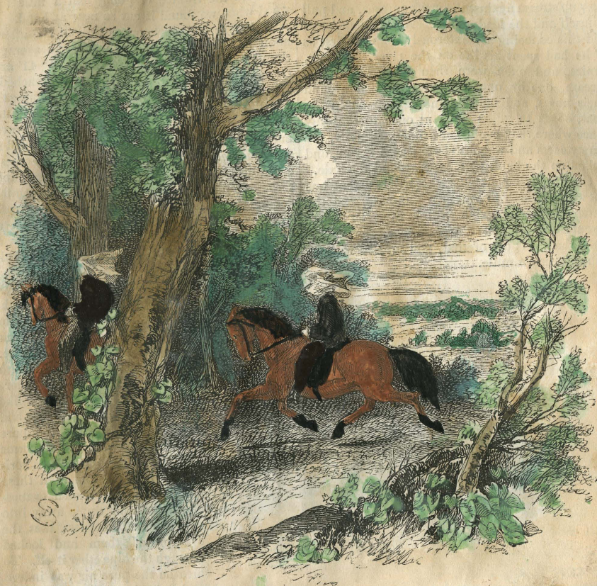
TAKING THE VAIL.