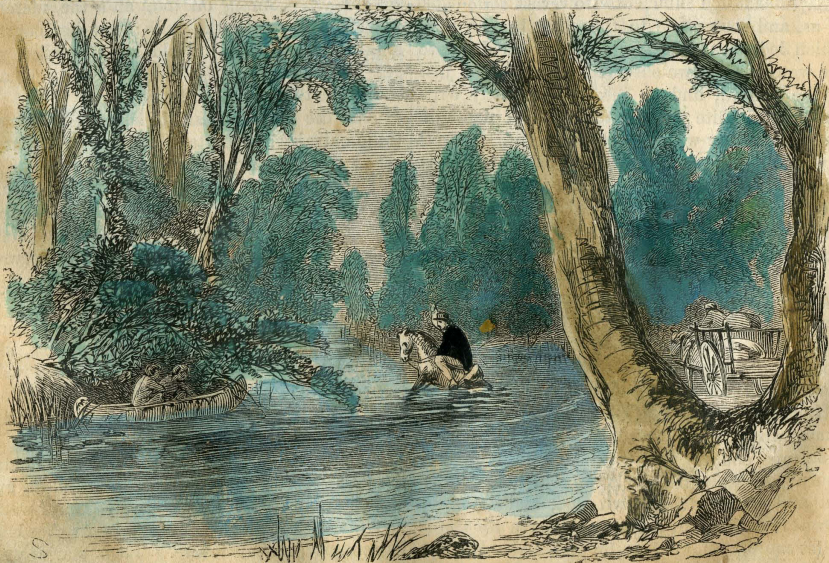
IN THE LIVE H... "NOW I LAY ME—" ... NEW YORK, NEW JERSEY, PENNSYLVANIA