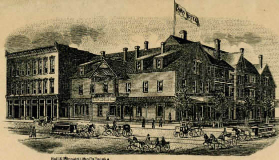
Hall &amp; McDonald Litho Co. Topeka.