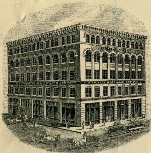
Wm. Hackett & Co. St. Paul.