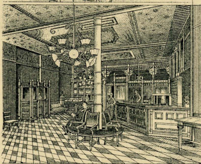
Hall & O'Donell Litho. Co. Topanga.