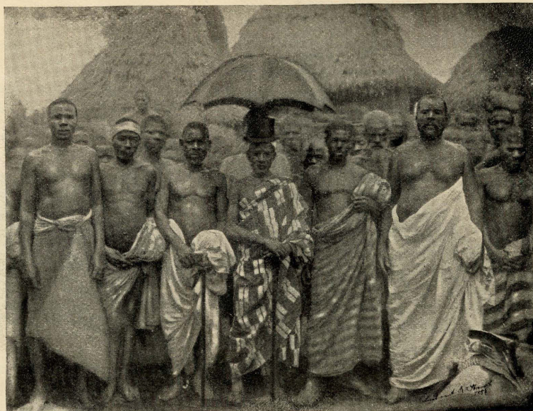
KING OF AGUEWÉ WITH HIS MINISTERS.

Commerce. The trade in this region, being extended to Salaga from the distant Sultanates in the North and East, Sokoto, Timbuctoo, Saccatoo, Kano, Bornoo, Bagirmi, Waday, etc., consists mostly of kola-nuts, brass, copper, cotton etc. stuffs, and rum in exchange for ivory, ostrich feathers, horses, donkeys, cattle, slaves, stuff, shea-butter and gold, and is carried on over good roads. Although the products of agriculture at present exported are very limited, they still present an important feature in the great markets of the interior, at the Adaklu Mountain, in Bolu, Towe, Kpandu and Kratji. The primitive forests of the hill ranges now contain rich and seemingly inexhaustible amounts of palm kernels, india-rubber,