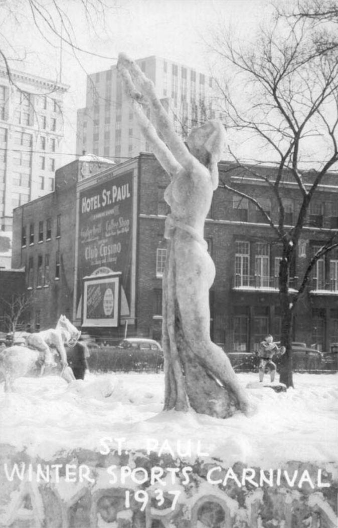
ST. PAUL WINTER SPORTS CARNIVAL 1937