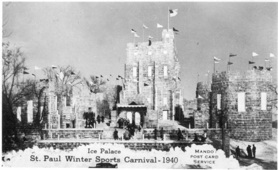
Ice Palace St. Paul Winter Sports Carnival - 1940