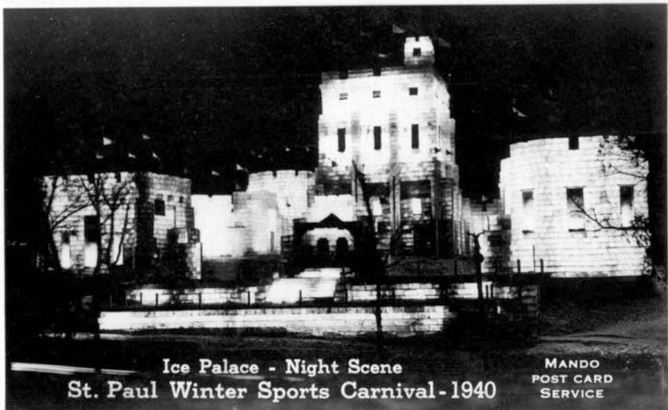
Ice Palace - Night Scene St. Paul Winter Sports Carnival-1940