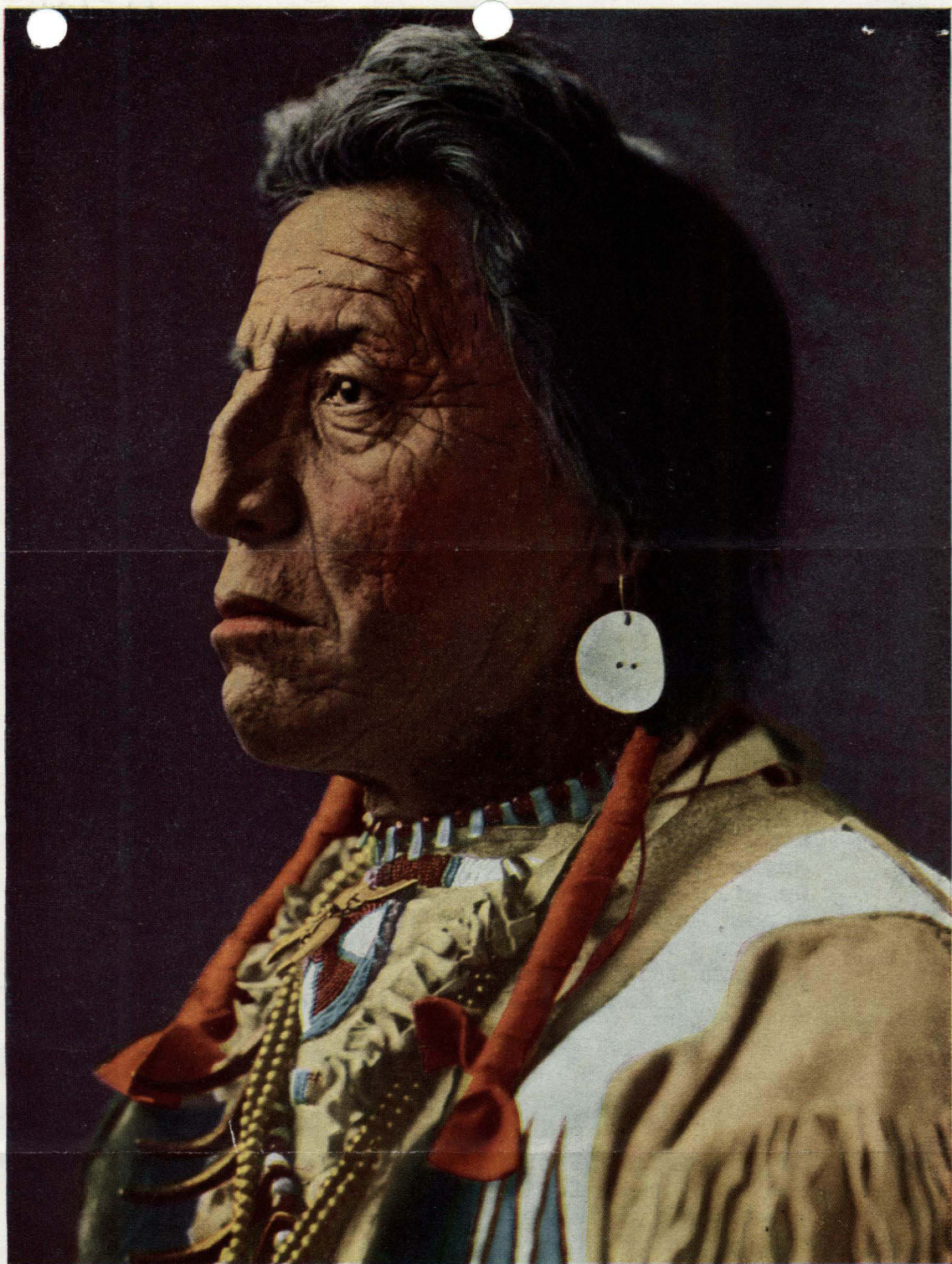
Two Guns White Calf

“On-sta-pokoha” is one of the hereditary chiefs of the Blackfeet Tribe of Glacier National Park. Once the lords and masters of the whole eastern slope of the Rockies from the Saskatchewan to the waters of the Yellowstone and now as much a part of Glacier Park as the mountains, glaciers and lakes.