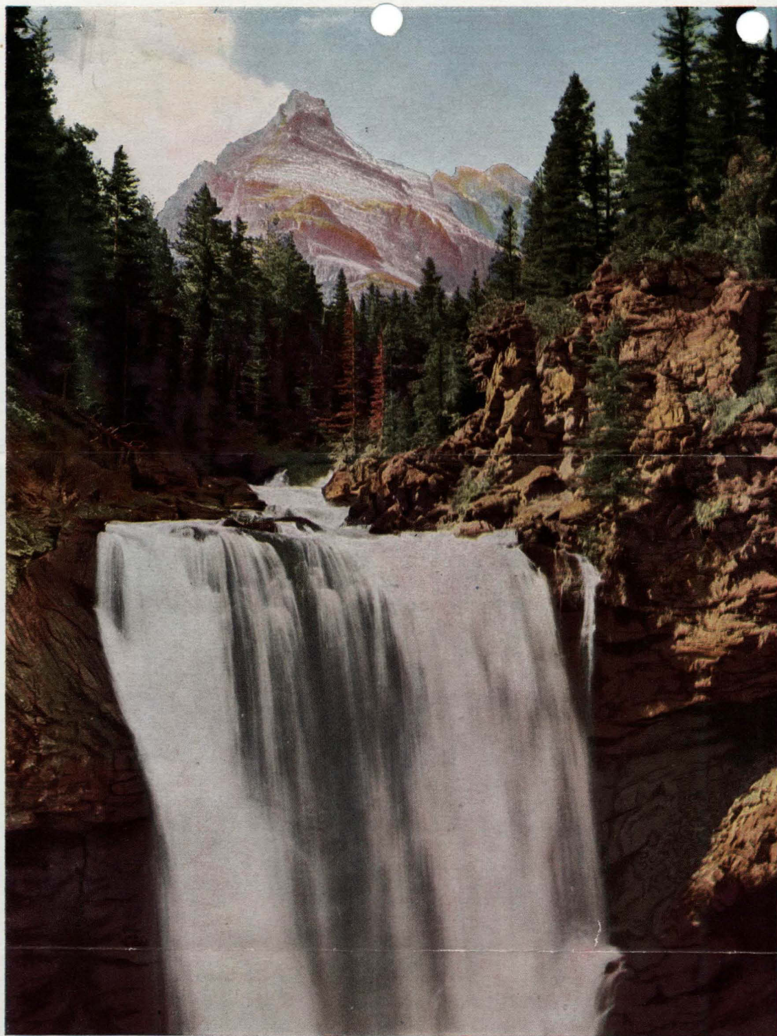
Dawn Mist Falls

If you follow the trail around Appekunny Mountain and over Red Gap Pass you come suddenly upon Dawn Mist Falls sparkling and shining in the sunlight. Here the tumbling and twisting waters of the south fork of the Belly River drop a hundred feet to the floor of the valley, ever in a hurry to reach the sea.