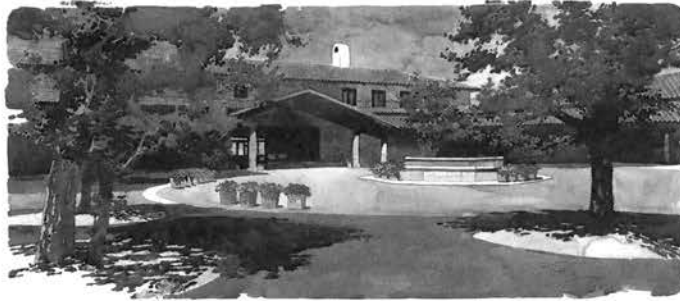
The Ronald Reagan Presidential Library, Simi Valley, California