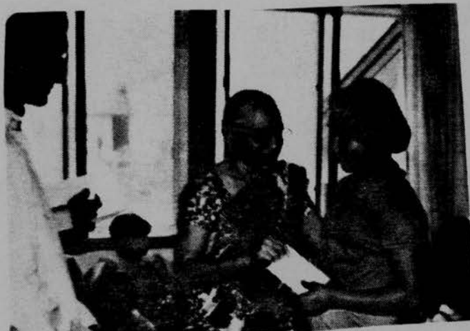
THE AWARDS PRESENTATION