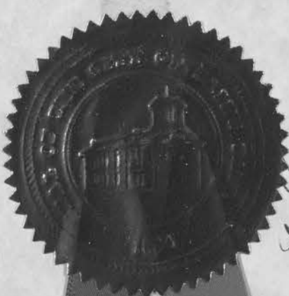
George Latimer George Latimer Mayor of St. Paul

AND FURTHER, proclaim the commitment of the Mayors of these Twin Cities to the principles of social reform and justice enunciated by Mahandas Gandhi.