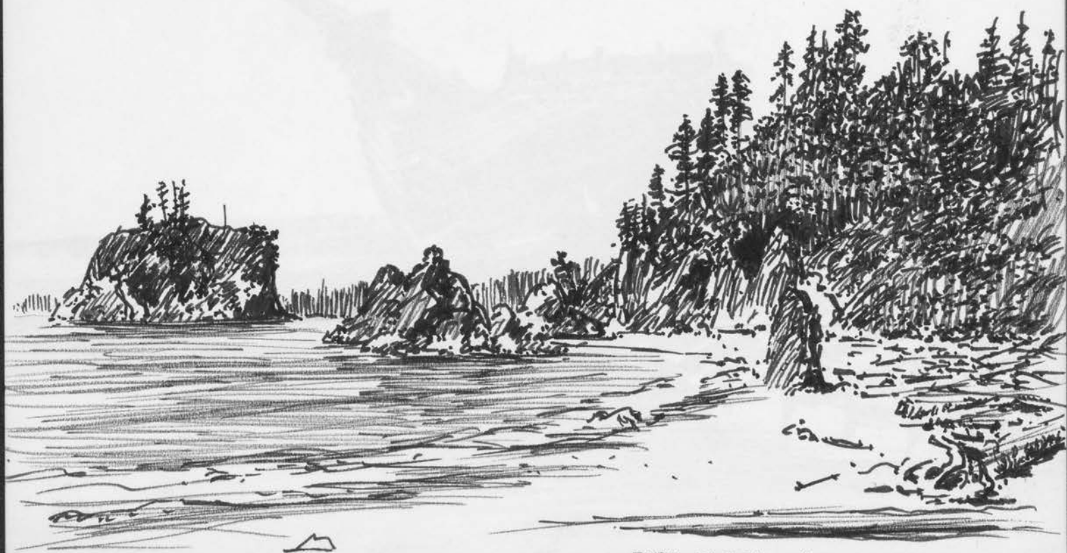
RUBY BEACH WASHINGTON