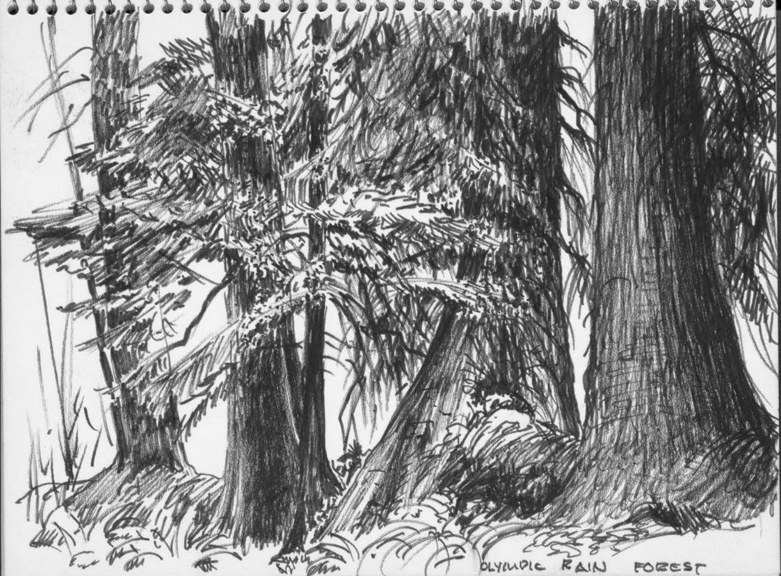
OLYMPIC RAIN FOREST