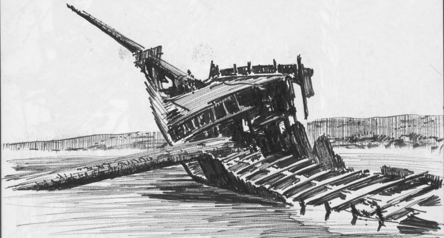
WRECK OF THE PETER IREDALE