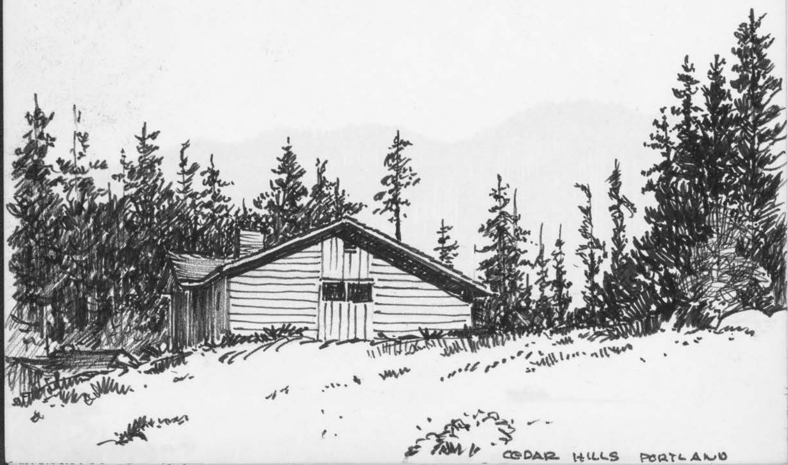
CEDAR HILLS PORTLAND