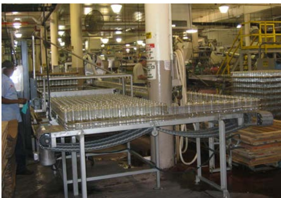
Glass jars are fed into the line