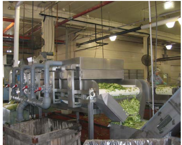
All cucumbers are blanched in this steam blancher for easier packing