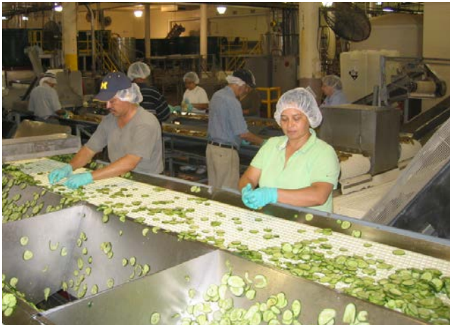
The grading line. Only the perfect slices stay on the belt