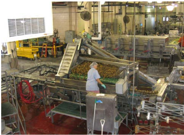
Pickles join glass at packing machine and are almost completely filled there.