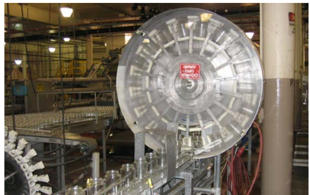
Glass jars are inverted in a rotating wheel over air jets to vacuum out any case dust.