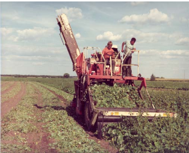
Machine harvesting cucumbers in Wisconsin