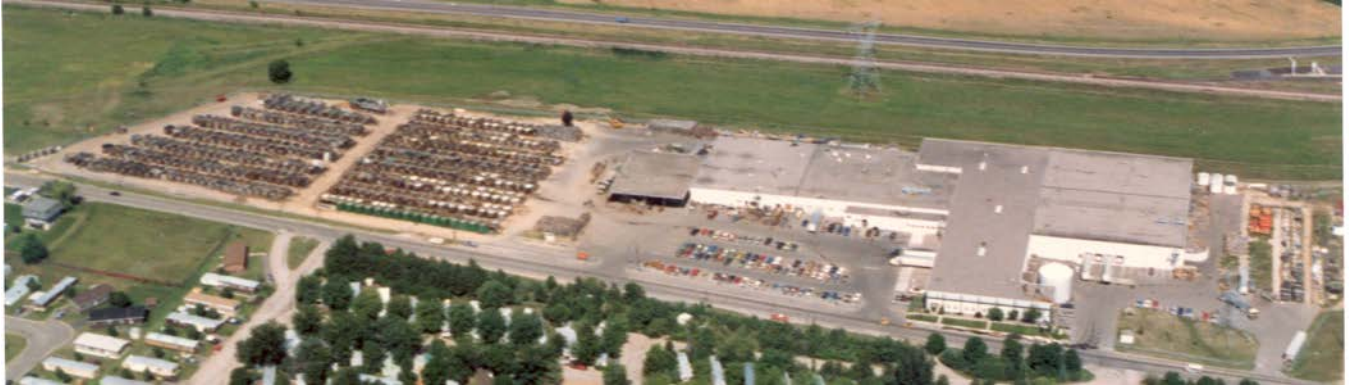
Aerial view of the present plant in Chaska Township as it appeared in the 1970's. The salt stock pickle tanks at the extreme left end were reduced by almost two thirds when the company discontinued food service pickle manufacturing. Otherwise, nothing else has changed.