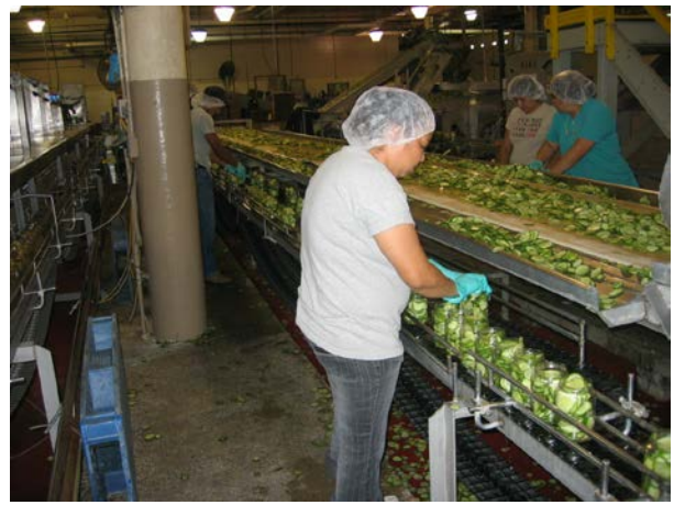
Toppers finish the filling job