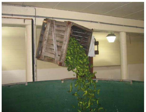
Sorted fresh cucumbers are dumped into a tank of cold water whence they will be pumped to the slicer.