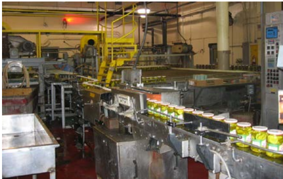
From the pasteurizer the jars are labeled