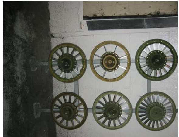
High speed cutting wheels. The more blades in the wheel, the thinner the slices.