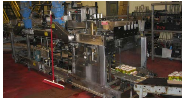
A caseoff machine drops the jars into cardboard trays.