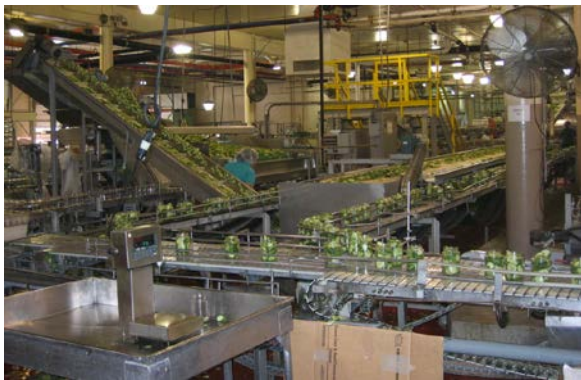
Topped off jars on their way to juice and caps