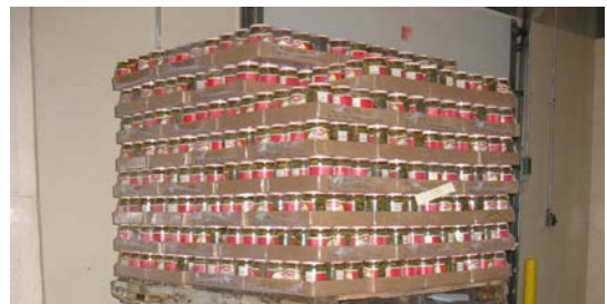
Trays are shrink-wrapped, palletized, and ready for shipment