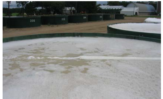
Brine curing of cucumbers produces carbon dioxide gas causing the cucumbers to be bloated and unusable. Purging prevents this by circulating air through the tank as can be seen above by the white streak and foaming.