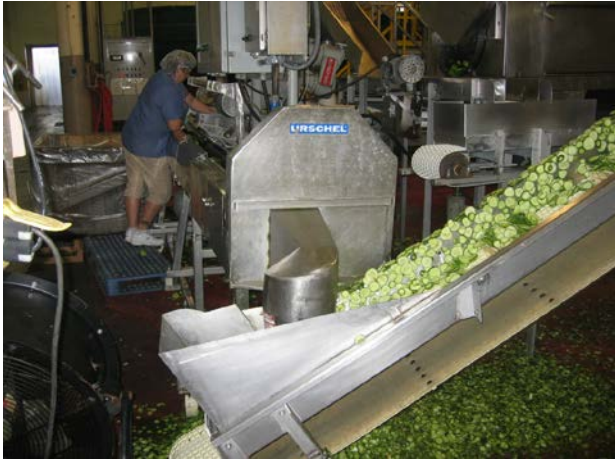
Sliced cucumbers emerging from cutter after passing through high speed spinning slicing wheel.