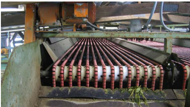
Fresh cucumbers coming from the field are sorted by width as they fall through ever-widening openings between moving tubular belts