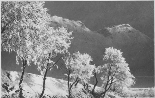
So beautiful so high! Viel Glück u. Freude!