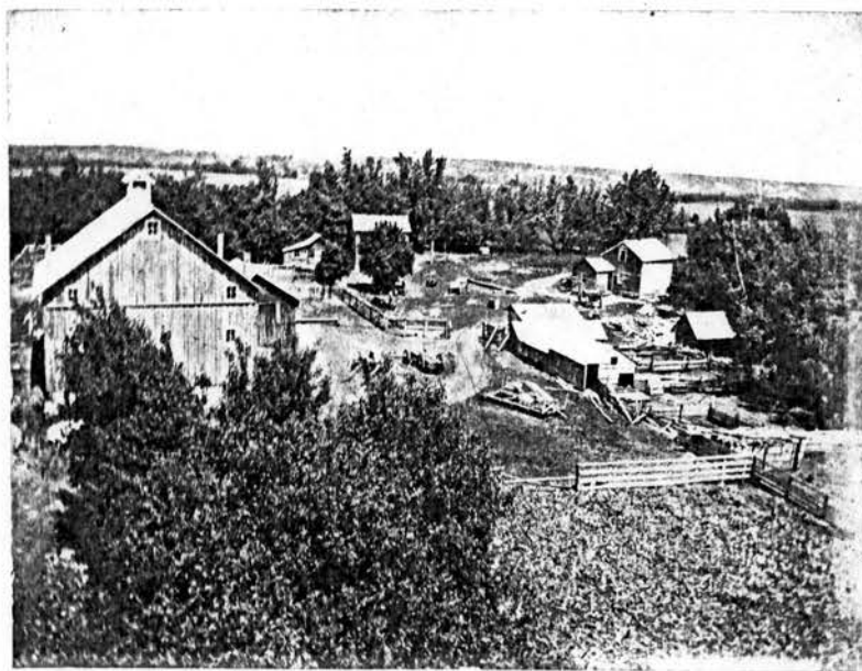
Farmstead of Anton Manderfeld as it looked in the late 1800s