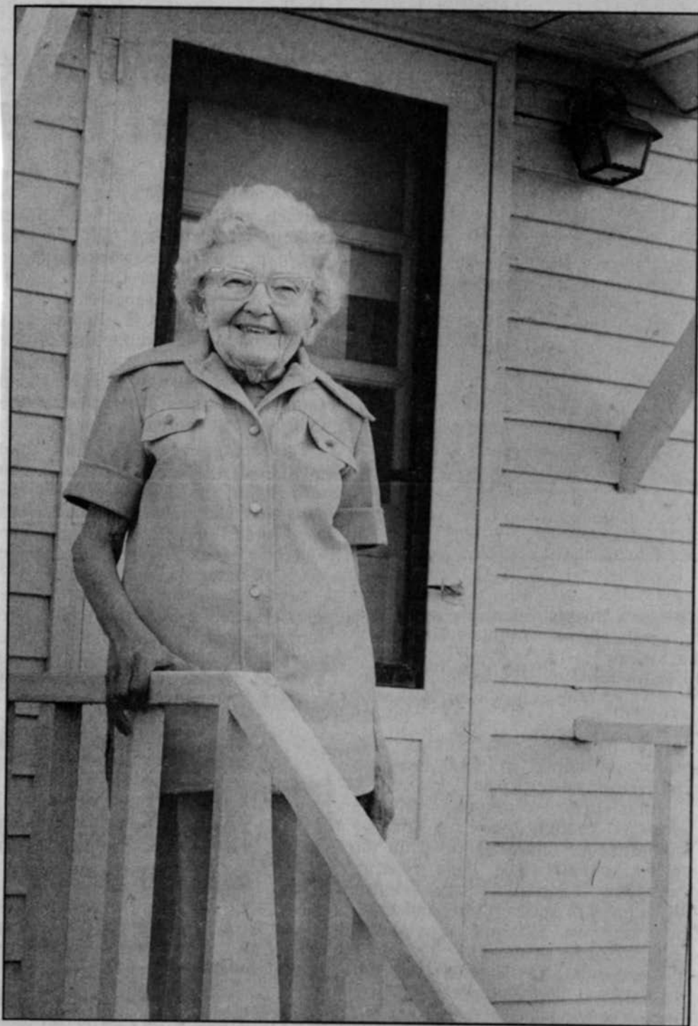
Century Farm designation to be sought