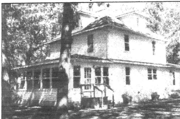
Original Ose "Four Square" in Sec. 26. The two-story log portion of the main house was finished in 1915, front porch and back area added recently. Home of Loiell and Mary Dyrud