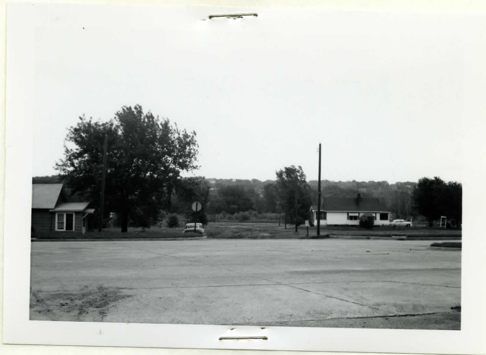
VIEW OF THE STREET LOOKING NORTH FROM NAGASAKI ROAD