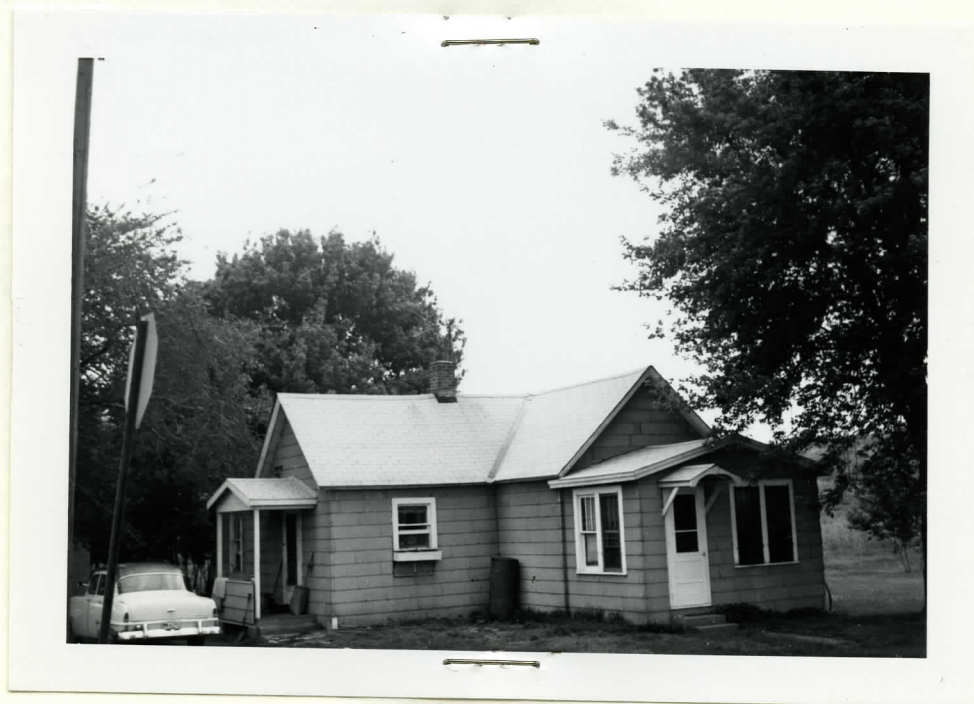
ANGLE VIEW OF THE FRONT