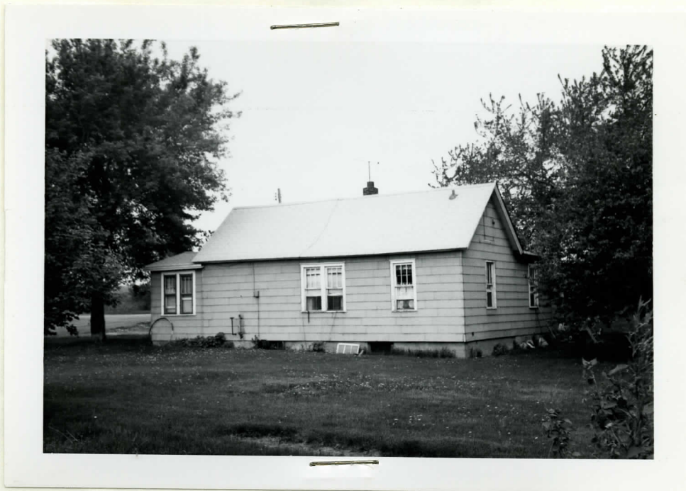
ANGLE VIEW OF THE SIDE AND REAR