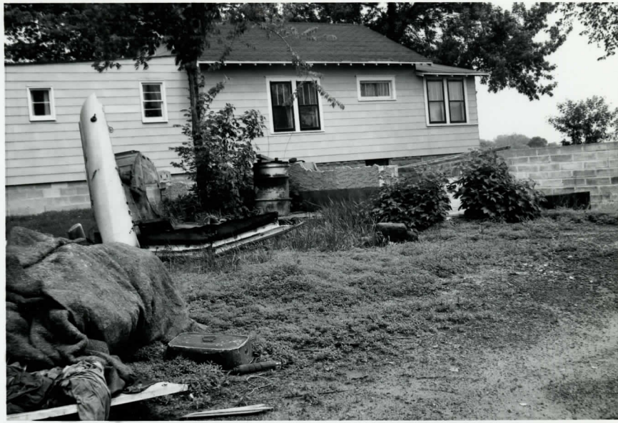
SIDE VIEW LOOKING SOUTHEAST OF LOTS 1 & 2