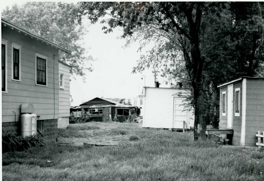
OUT-BUILDINGS & SHED ON LOT 2