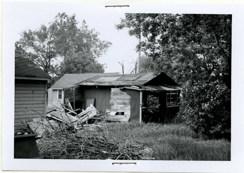
VIEW OF GARAGE - LOT 2