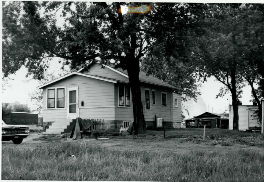
FRONT VIEW OF LOT 2