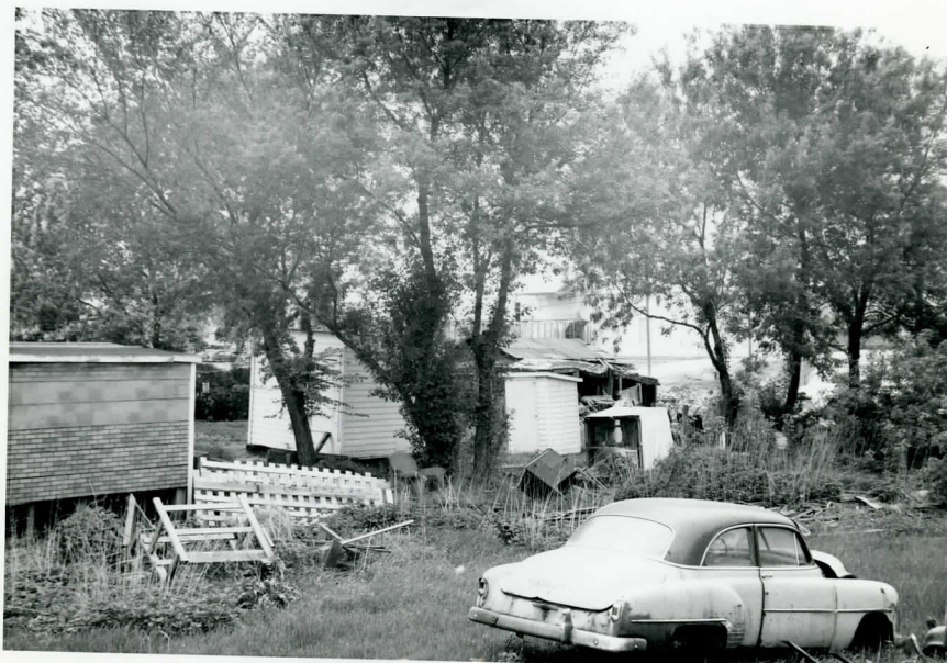
OUT-BUILDINGS ON LOT 2