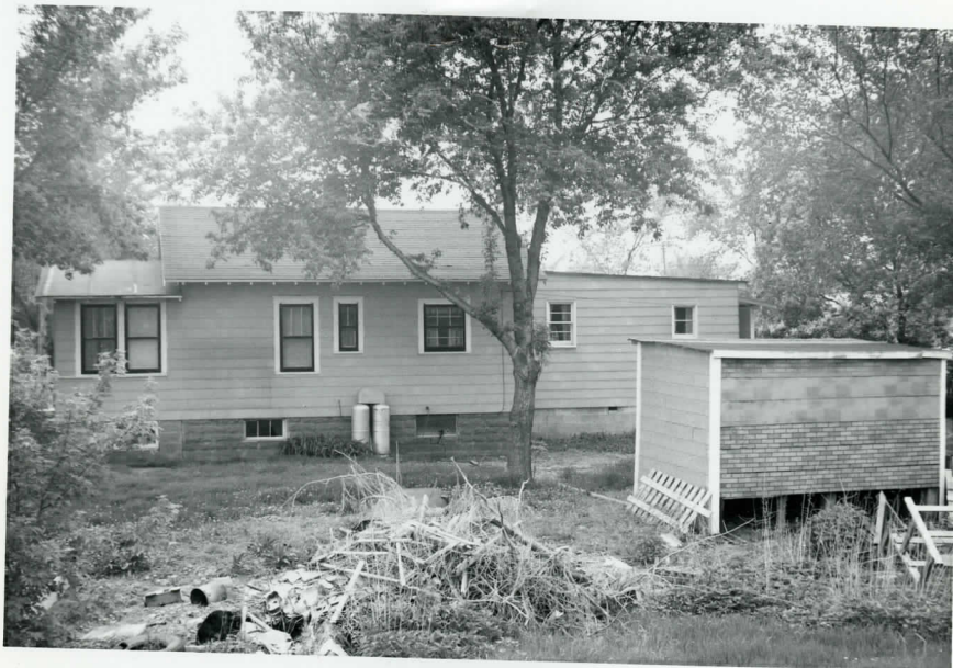
SIDE VIEW OF LOT 2