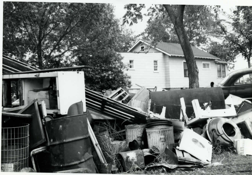
ANGLE VIEW TO SOUTHEAST OF LOTS 1 & 2