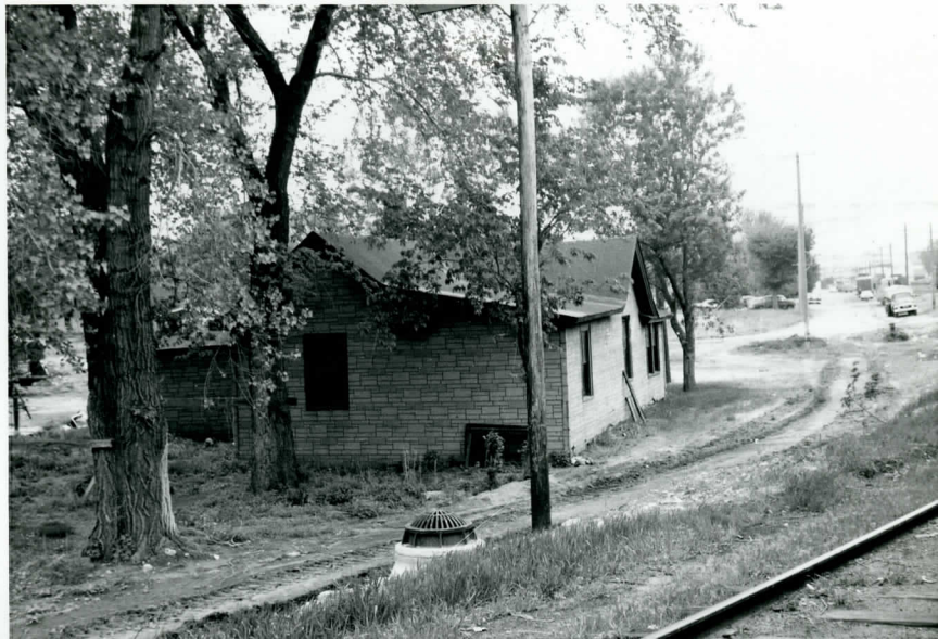
ANGLE VIEW TO THE SOUTHWEST OF IMPROVEMENT LOCATED ON THE NORTH PORTION OF LOT 10