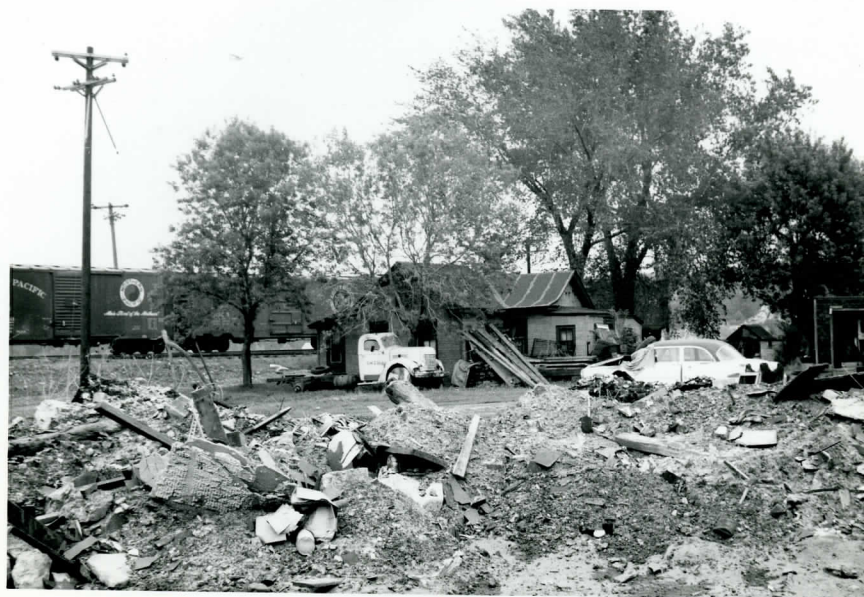
ANGLE VIEW LOOKING NORTHEAST OF IMPROVEMENT LOCATED ON NORTH PORTION OF LOT 10