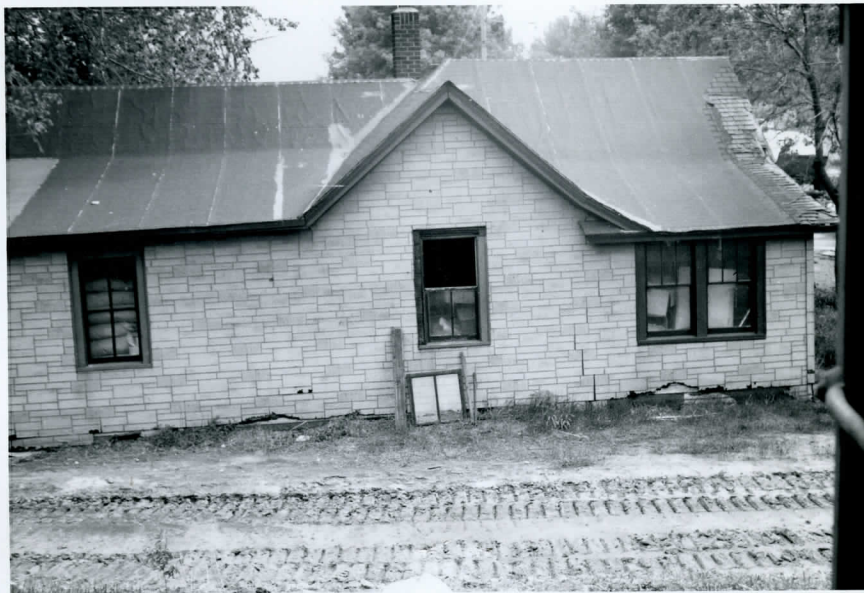
VIEW OF REAR OF IMPROVEMENT LOCATED ON NORTH PORTION OF LOT 10