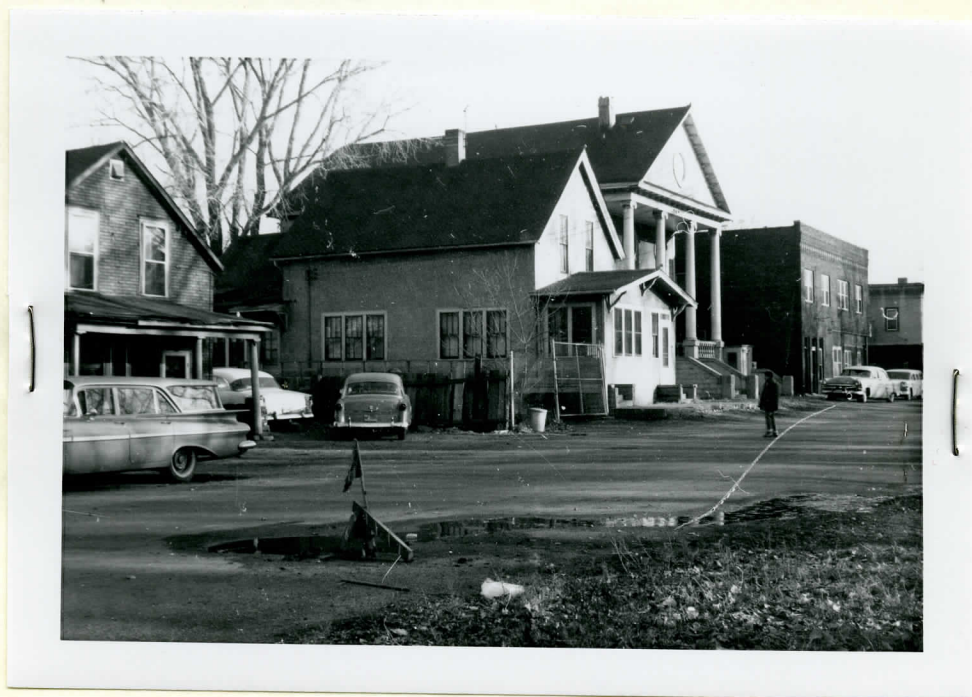
Street View facing South