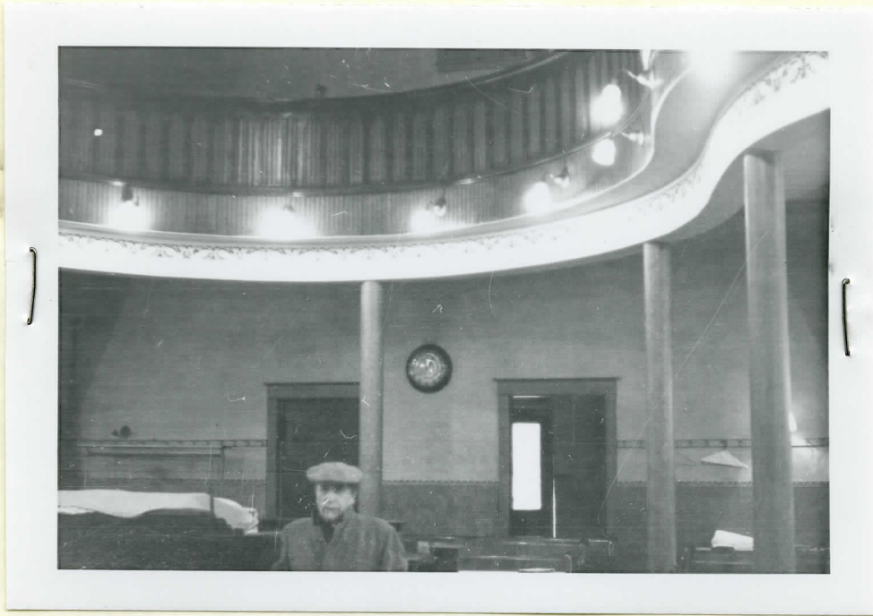
View of Balcony and near of upper chapel

Project area 1 B Parcel No 47 110 Robertson