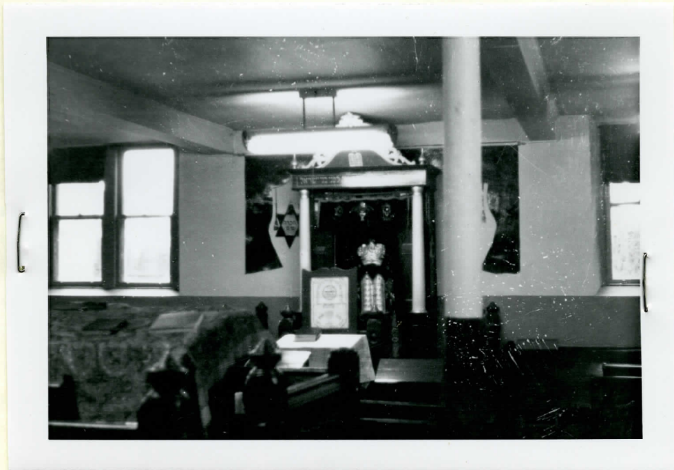
View of Ark of the Covenant in lower chapel