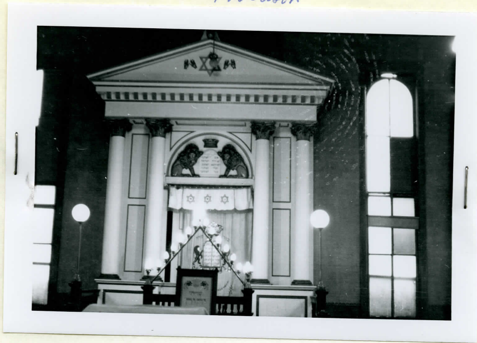
Interior Views of Ark of the Covenant in upper chappell

Project Area 1B Parcel No 47 110 Robertson