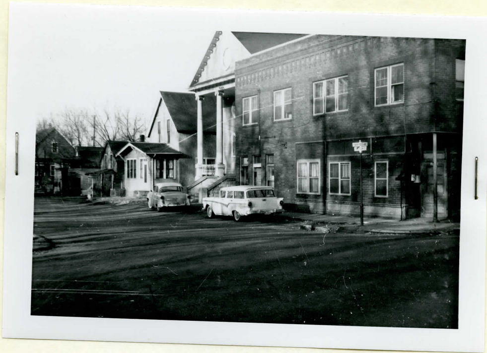
Street View Facing North

Project area 1 B Parcel no 47 110 Robertson