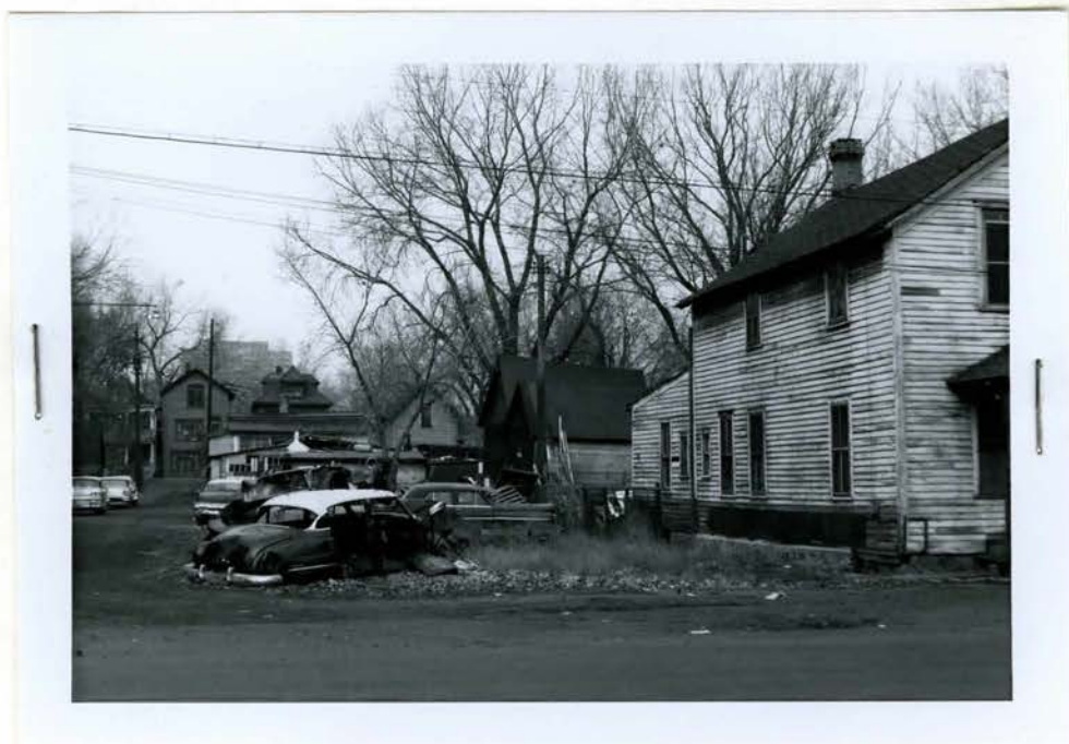
Side View of Vacant Lot