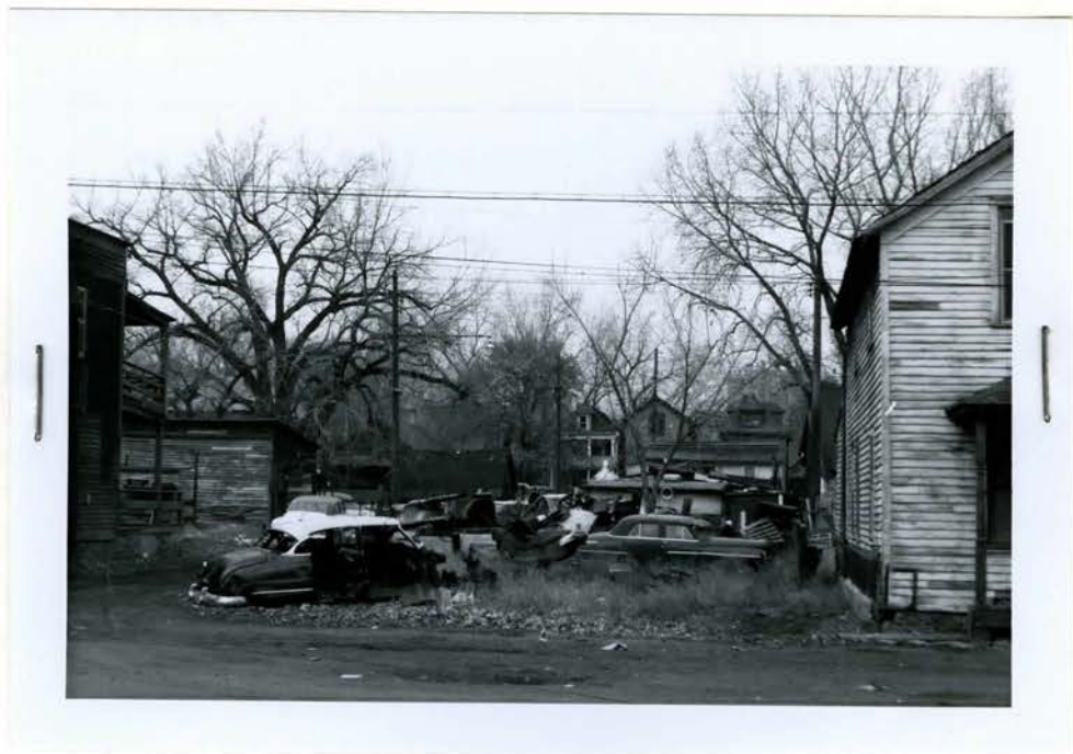
Front View of Vacant Lot

Project Area 1B Parcel No. 140B Vacant Lot on East Chicago