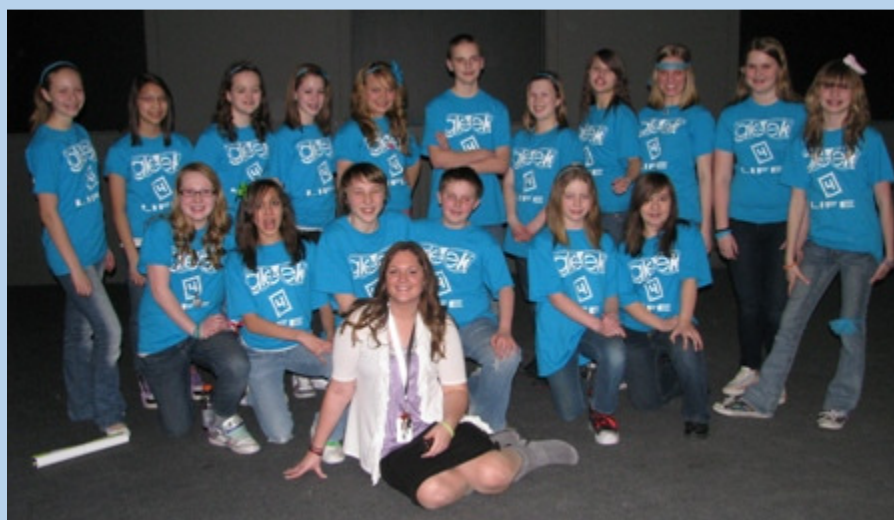
Paideia Glee Club at MOA

Last Thursday, the Paideia Academy Glee Club was lucky enough to compete in the Fox 9 Glee Invitational in the Rotunda at the Mall of America! The group sang the song "Fireflies" by Owatonna's own group Owl City. They did an AMAZING job! They