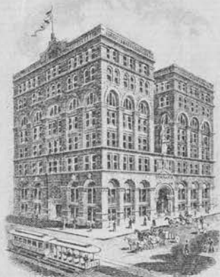
4 TH & MINNESOTA STS. GERMANIA LIFE BLD'G.