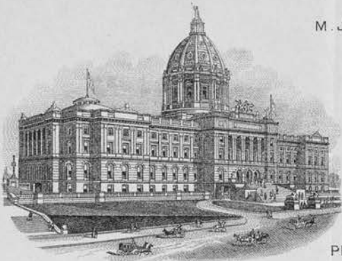
NEW STATE CAPITOL IN COURSE OF CONSTRUCTION.