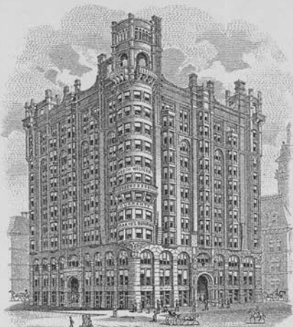
SUITE 1235-39 GUARANTY BUILDING.