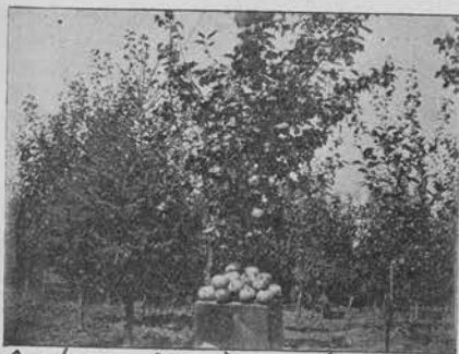
Acker Twice girdled