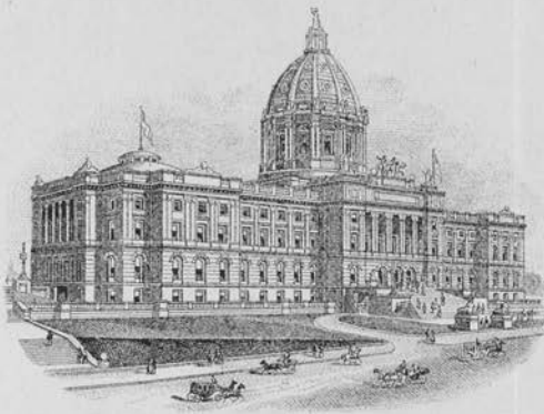
NEW STATE CAPITOL IN COURSE OF CONSTRUCTION.