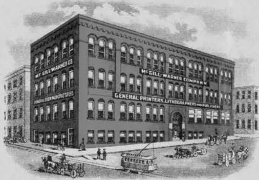
CEDAR, EIGHTH AND NINTH STS.