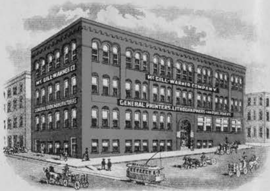
CEDAR, EIGHTH AND NINTH STS.