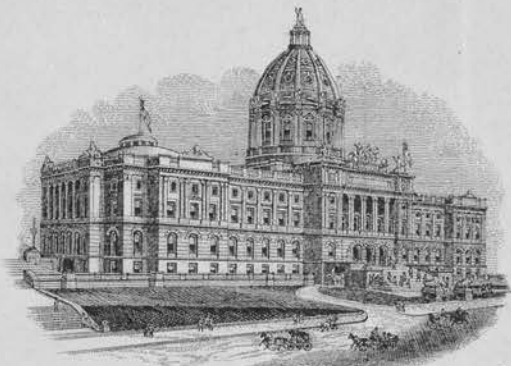
NEW STATE CAPITOL IN COURSE OF CONSTRUCTION.