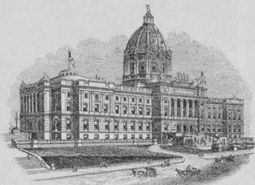
NEW STATE CAPITOL IN COURSE OF CONSTRUCTION BY GILMAN & CO., CHICAGO, ILL., 1888