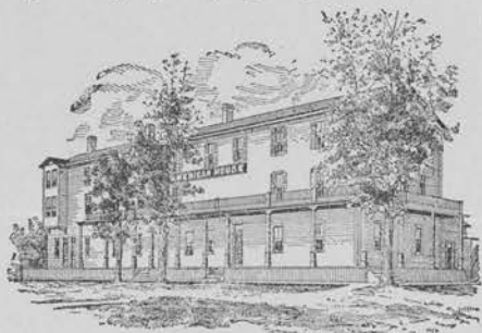
STEAM HEAT AND BATH.