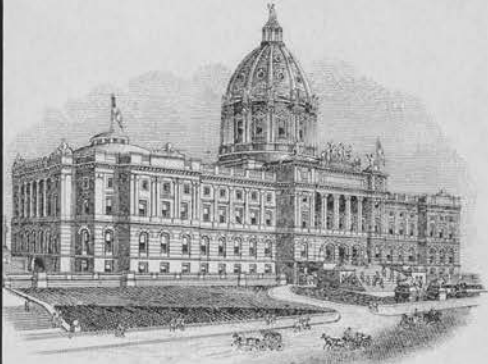
NEW STATE CAPITOL IN COURSE OF CONSTRUCTION WOODMAN CO. LITH. ST. PAUL, MINN.