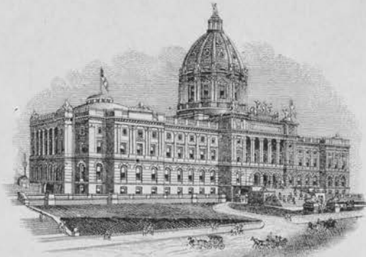
NEW STATE CAPITOL IN COURSE OF CONSTRUCTION. PHOTOGRAPH BY LEON SPAG, N.Y.