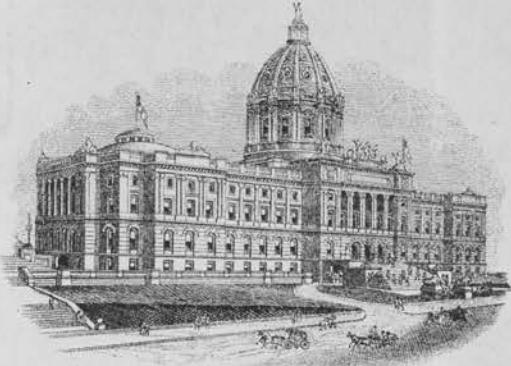
NEW STATE CAPITOL IN COURSE OF CONSTRUCTION