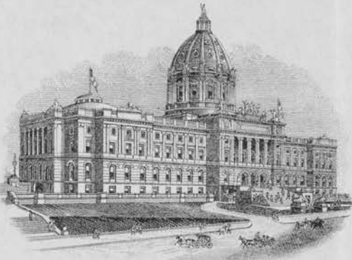
NEW STATE CAPITOL IN COURSE OF CONSTRUCTION FROM WINDOW OF LEGISLATIVE HALL