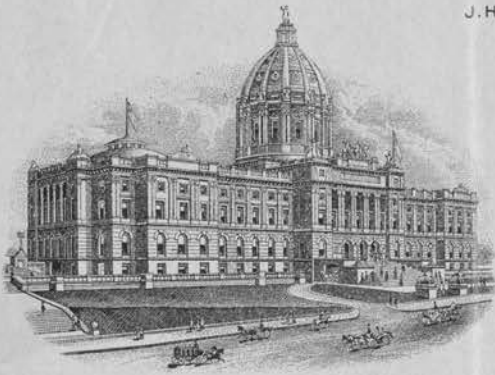
NEW STATE CAPITOL IN COURSE OF CONSTRUCTION.