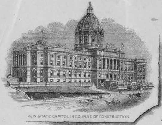
NEW STATE CAPITOL IN COURSE OF CONSTRUCTION.