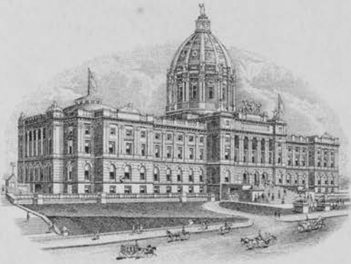
NEW STATE CAPITOL IN COURSE OF CONSTRUCTION