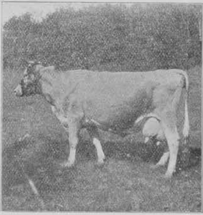
Queen of Salem, No. 8857, A. G. C. C., First Prize Wisconsin State Fair, 1899.