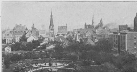
ST. PAUL, MINNESOTA.