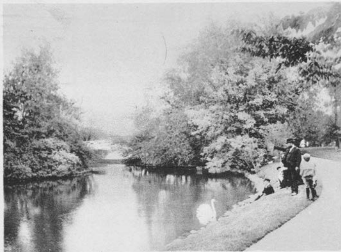
LORING PARK, MINNEAPOLIS.