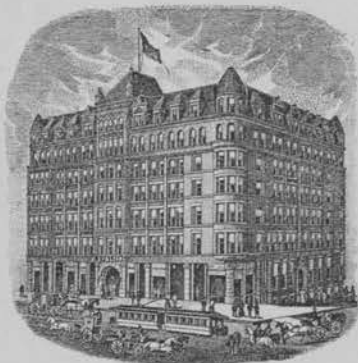
AMERICAN AND EUROPEAN PLAN.