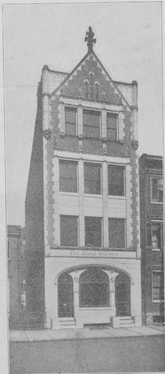
THE LLOYD LIBRARY - Erected in 1902.