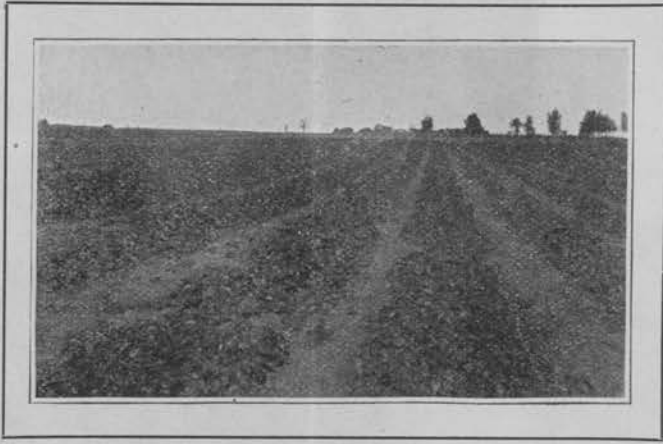
STRAWBERRY PROPAGATING BEDS