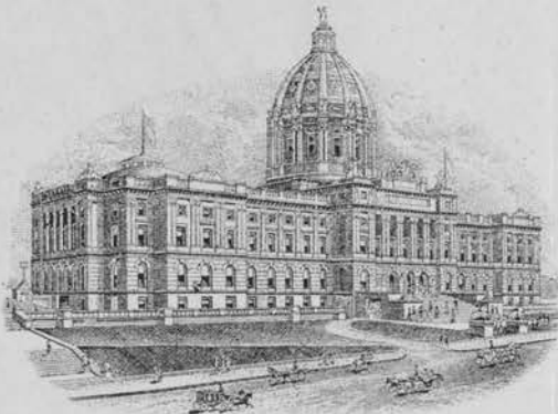
NEW STATE CAPITOL IN COURSE OF CONSTRUCTION.