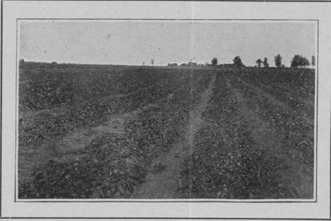
OUR STRAWBERRY PROPAGATING BEDS (from Snap-shot)