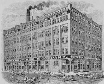
26, 28, 30 AND 32 HENNEPIN AVE.

CODES { AMERICAN SEED TRADE ASSOCIATION. A. B. C. FOURTH EDITION.