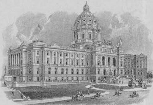
NEW STATE CAPITOL