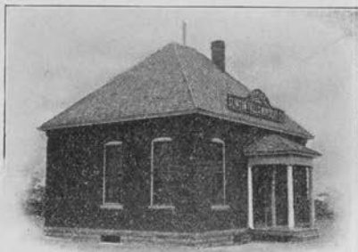
GOOD AGENTS WANTED