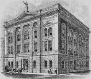
COMPANY'S HOME OFFICE.