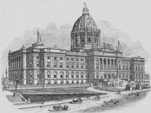
NEW STATE CAPITOL IN COURSE OF CONSTRUCTION.