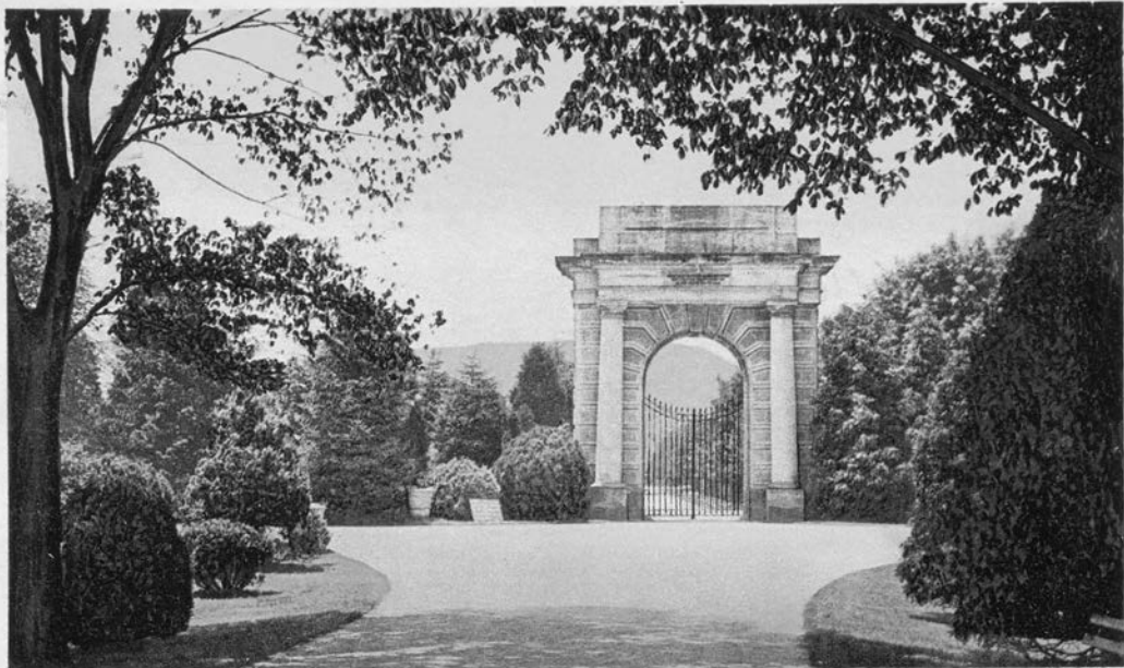
11116 ENTRANCE TO THE NATIONAL CEMETERY, CHATTANOOGA, TENN.