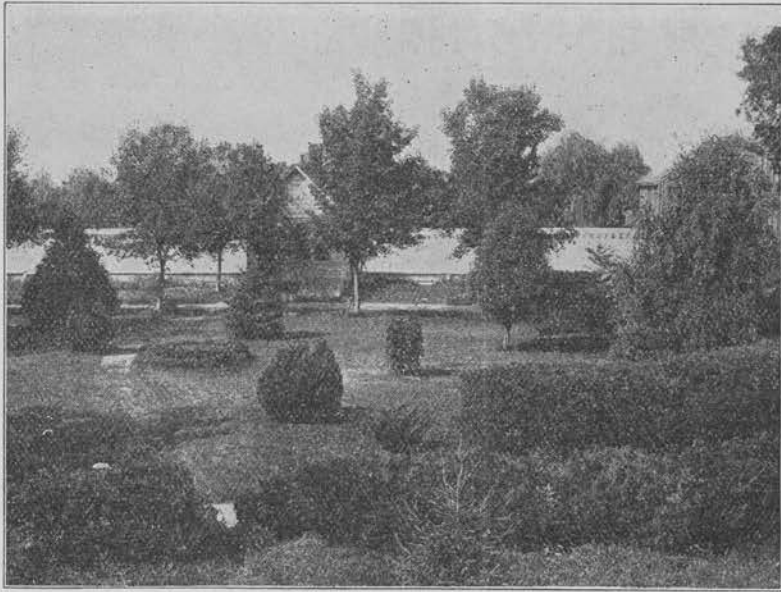
GREENHOUSE ATTACHED TO NURSERY