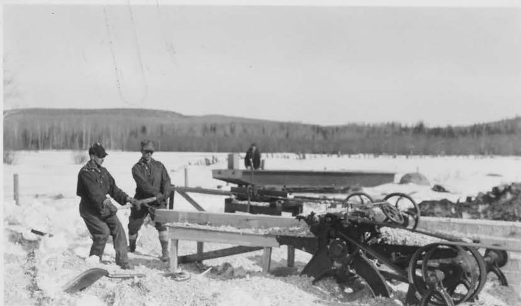
Making palisades for building construction Camp S-62