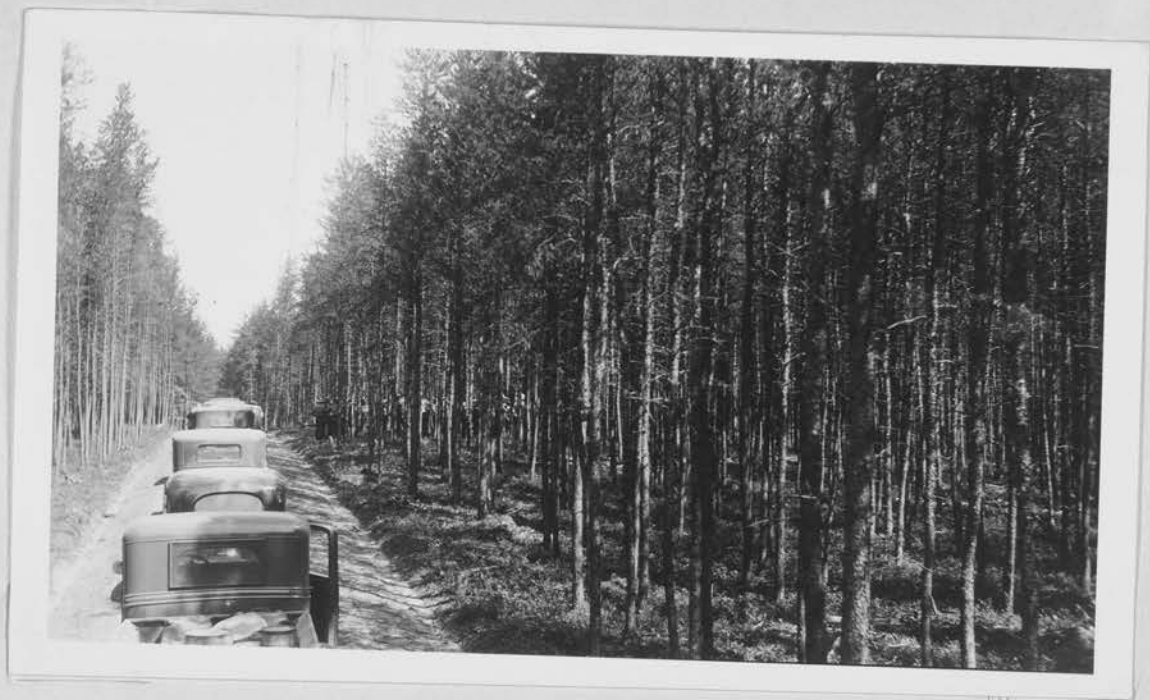
T.S.I. in Stand of Jack Pine. Camp S-53, Side Lake, St. Louis Co., Minn. Aug. 1935.