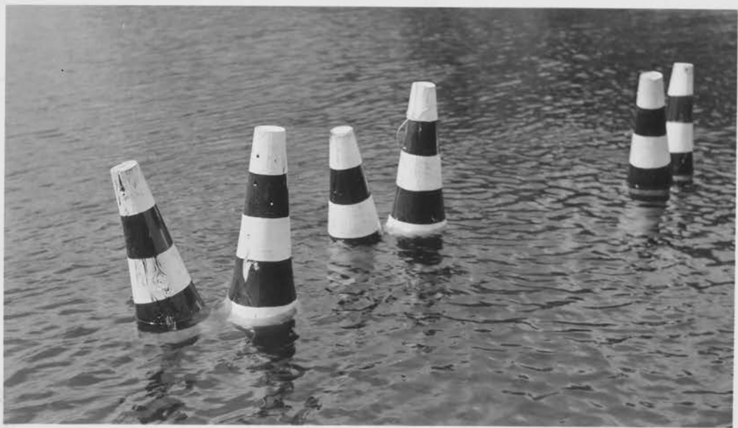
Navigation Buoys In Crane Lake T. 68 R. 17 Made & placed by Camp S-52 Curzon, Minn. winter of 1936-37.