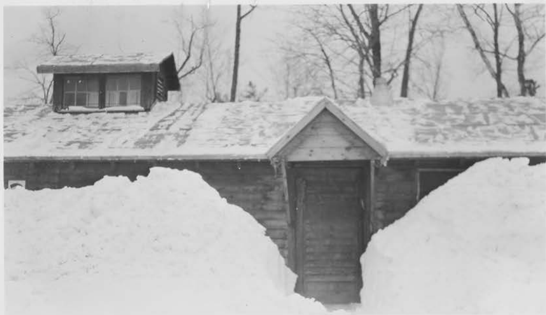
Entrance to green house Camp S-95, Deer Lake, Itasca Co. Winter of 1936-37.