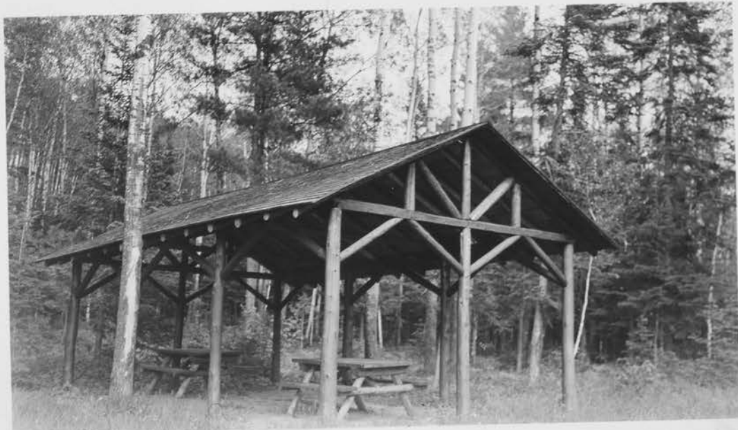
Log Shelter Public Camp Ground Wake'em-up Bay, Kabetogama Lake Camp S-52 Vermillion