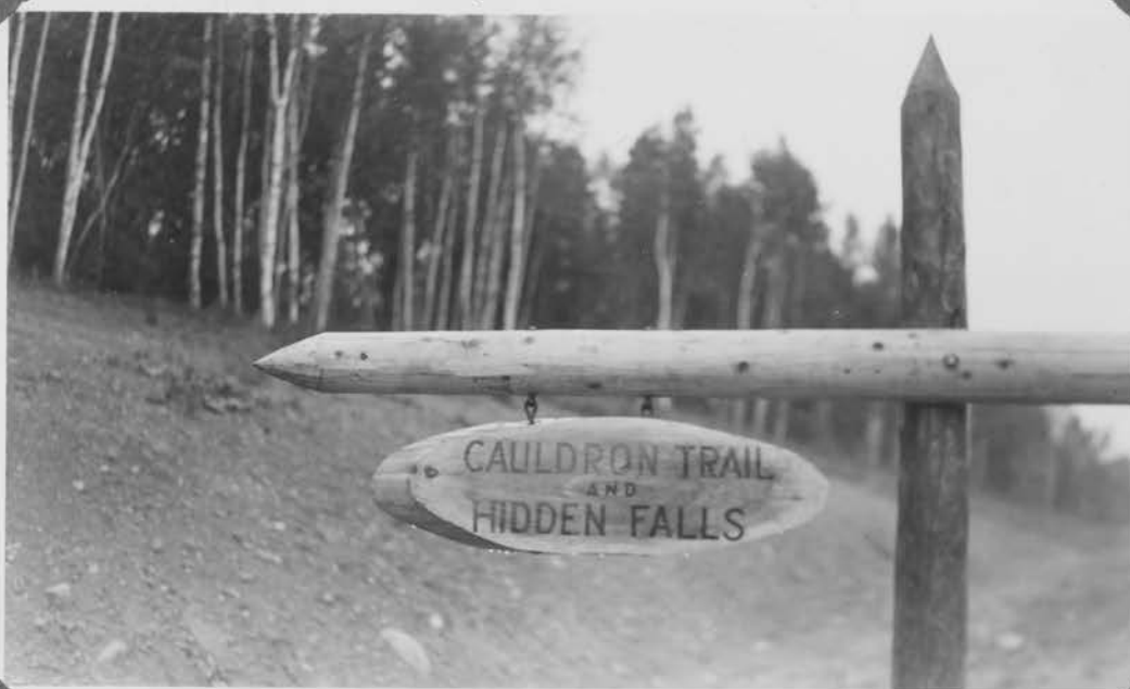
Sign E.C.W. Recreational Development