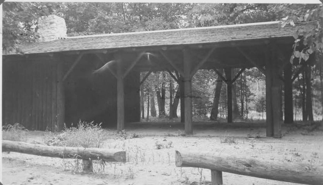
Camp Ground Shelter