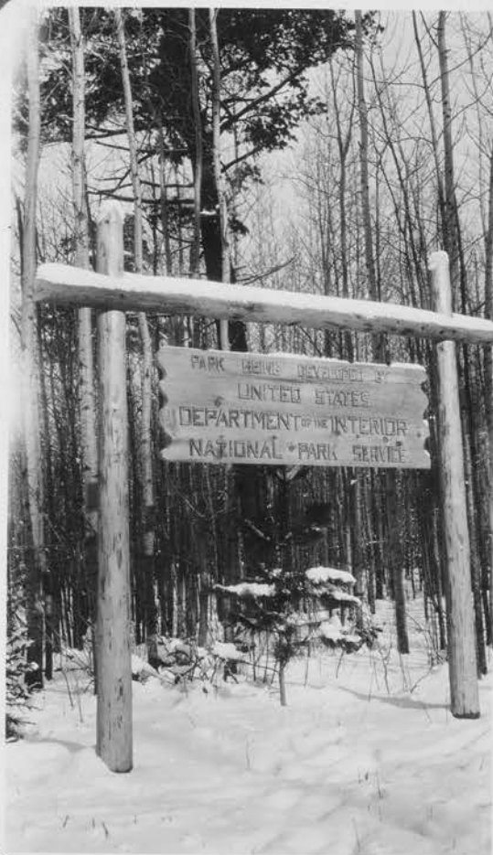
Typical Sign, USDA Scenic Park