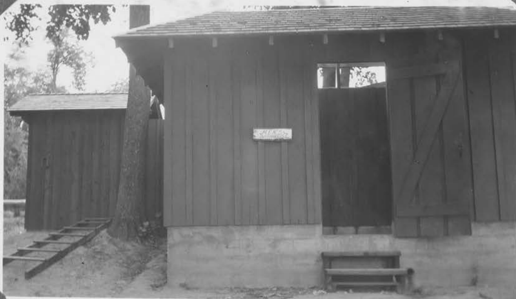
Bath House Roy Lake Beach, S-141