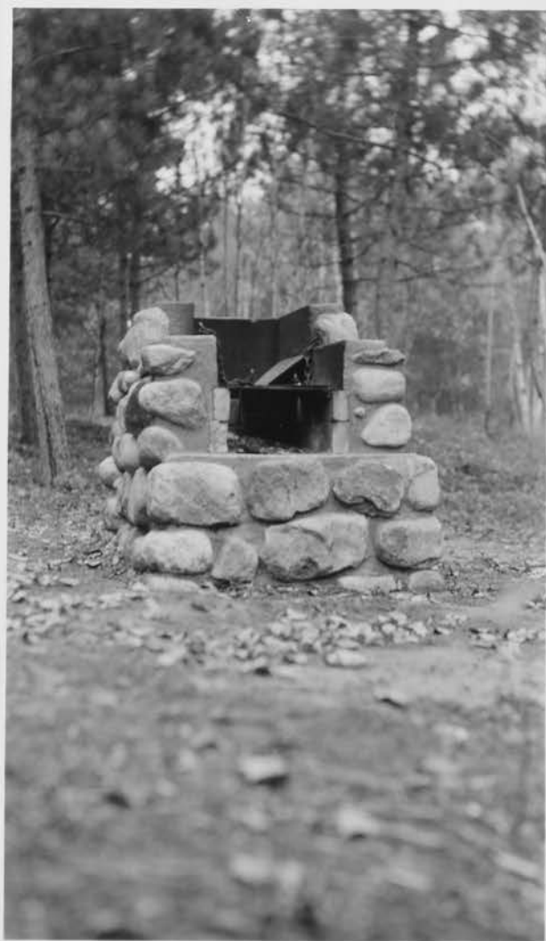
Fire place at Wakemum Camp ground, Lake Superior Sec. 36-63-18 By Camp S-52, Cusson, Minn. Sept. 29, 1938.