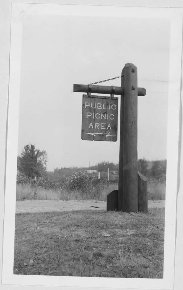
Camp S-52, Casson, Minn. Sept. 29. 1938 Picnic ground Sign, Public Camp at Cam.