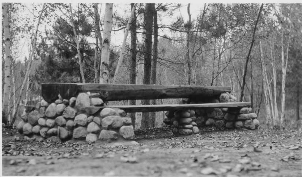
Solid End Picnic Table at Beatrice Lake Camp ground. By Camp S-53, 'Aide Lake, Minn.' Sept. 29, 1938.