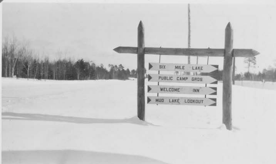
Directional Sign U.S.F.S.