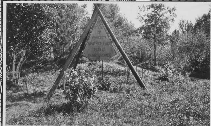
Sign Beatrice Lake Public Camp Ground Camp S-53