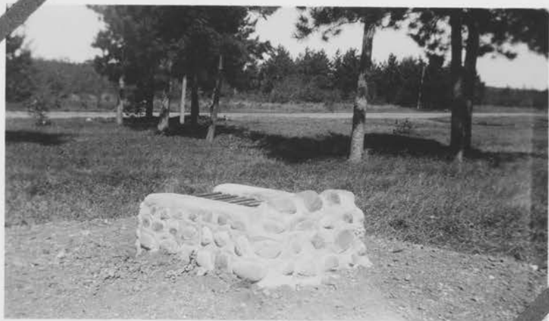
Fireplace Island Lake Camp Ground Camp S-51