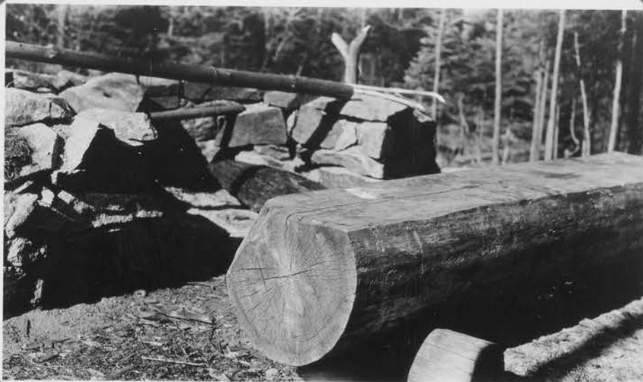
Fireplace Federal Camp Ely Buck Road