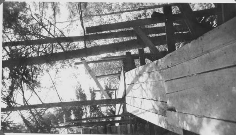
Work Platform Refectory Building Woodenfrog Camp Ground Camp S-52 July 1938