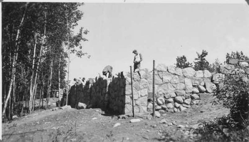
Rock Retaining Wall Parking Area