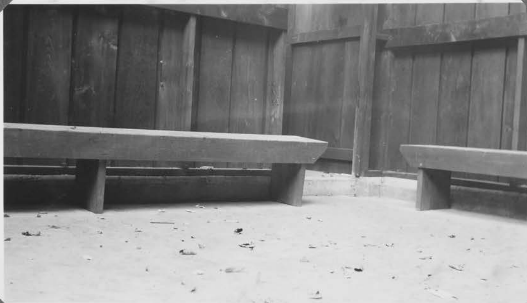
Interior Bath House Roy Lake Beach, S-141