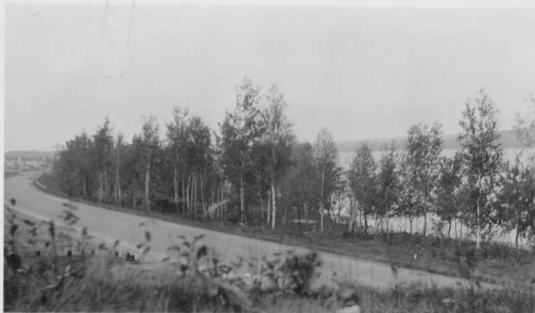
Parking Area Orr Public Camp Ground S-52 Cusson, Minn.