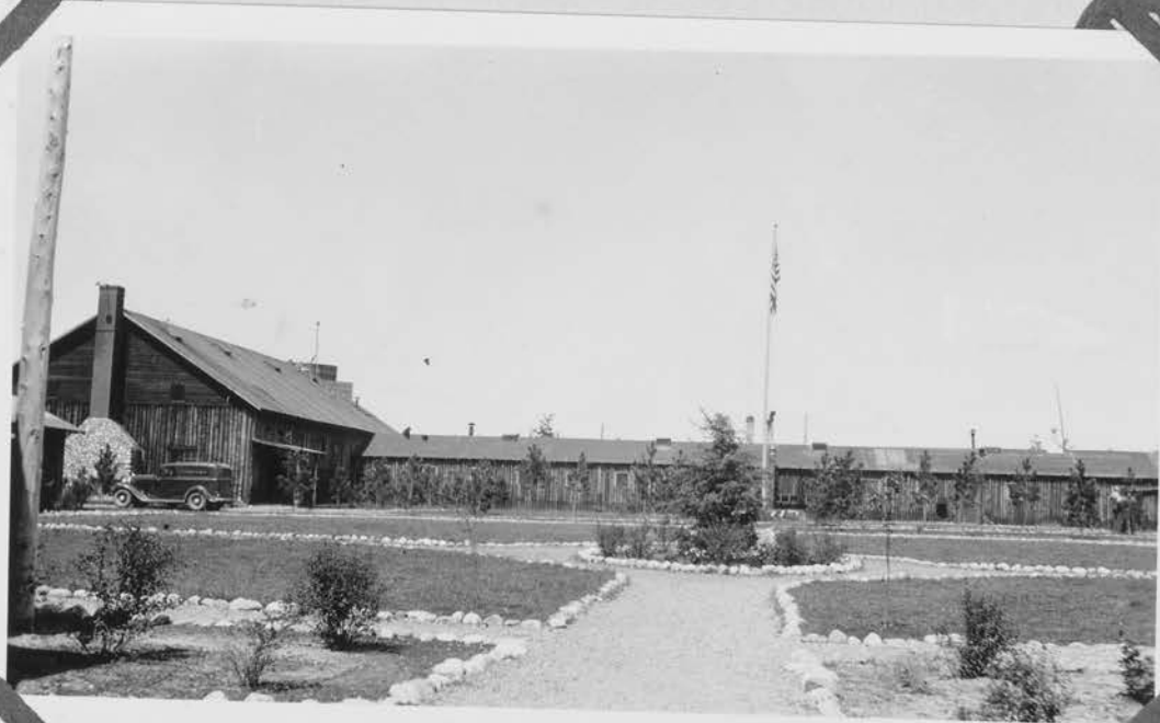
Camp S-53 Side Rock