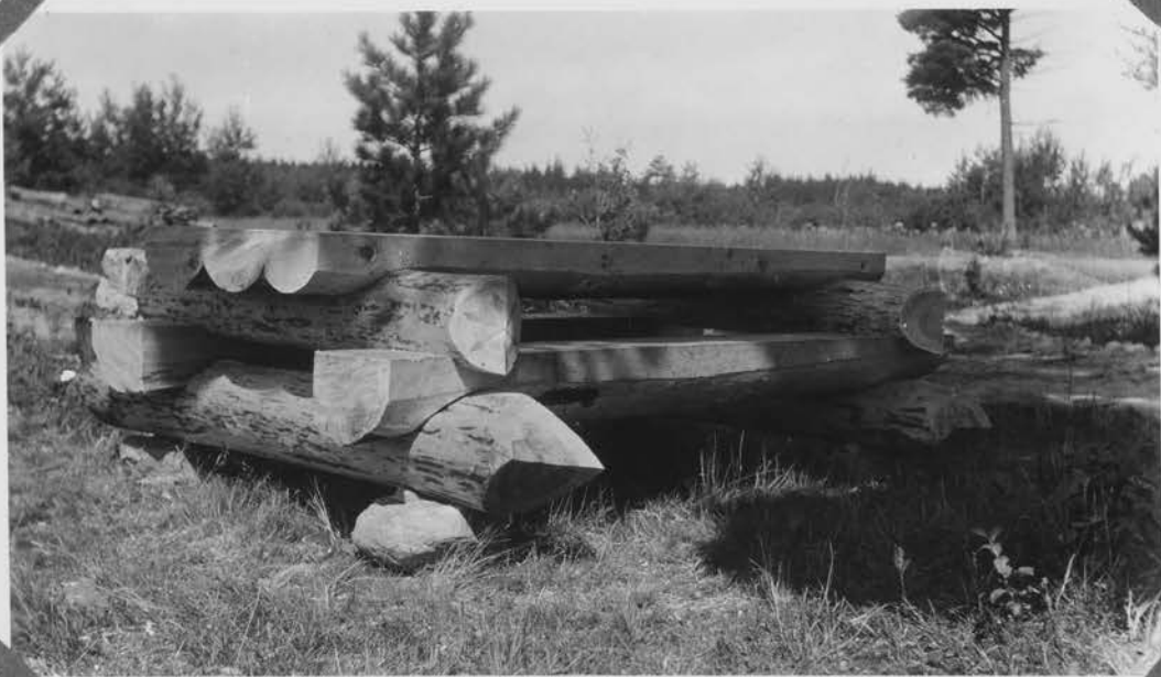
Camp 583 Bear Lake