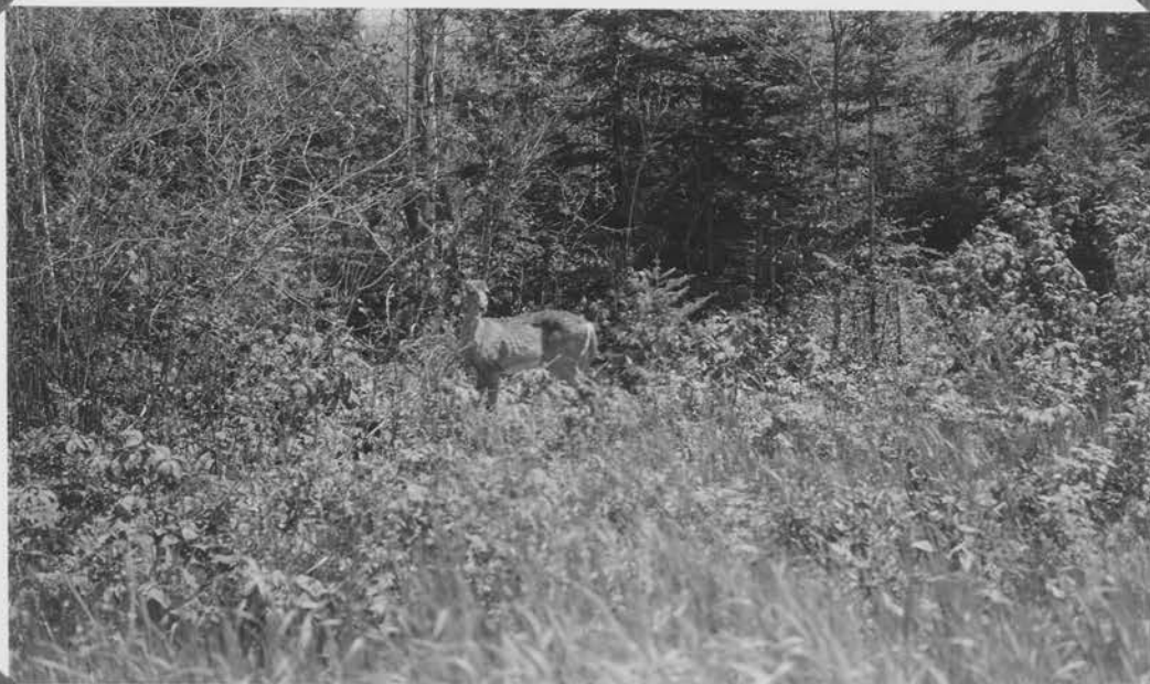
Wild deer on Echo Trail June 1936 -R.R.B.