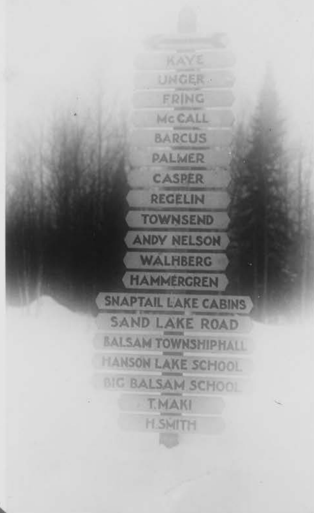
Road corner post signs Itasca Co. near Balsam Lake