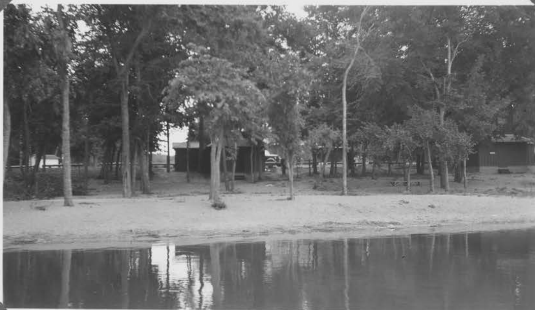
Beach and Bath Houses