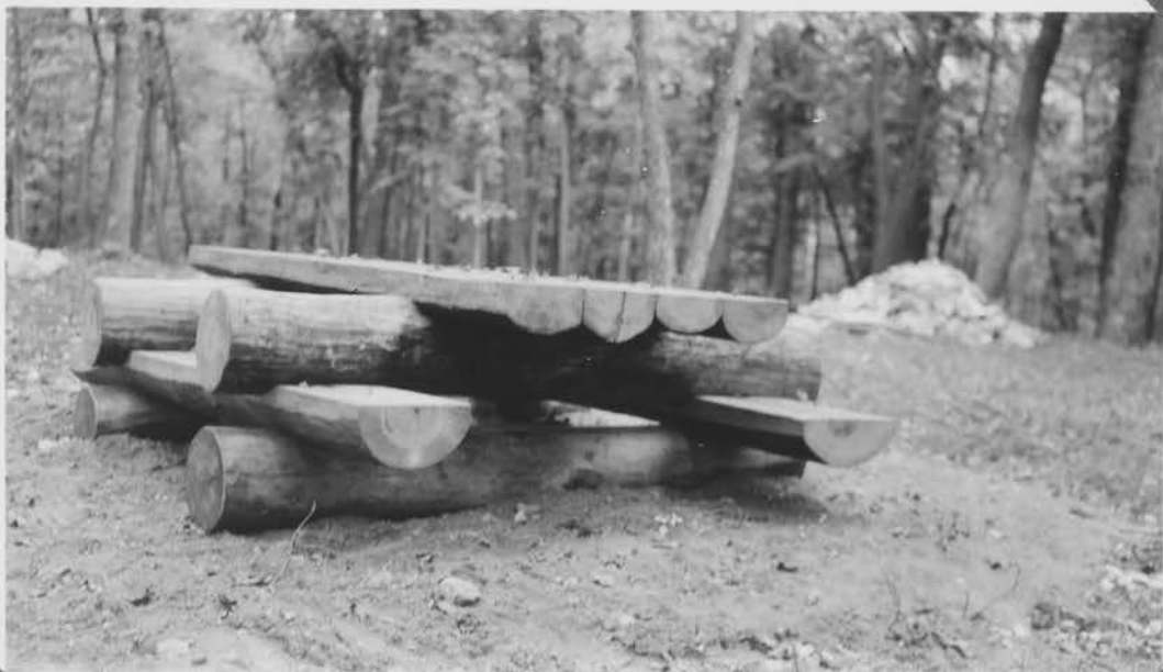
Log Deck Table