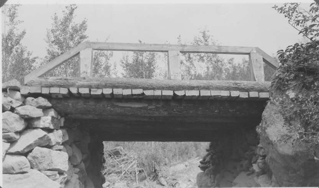
Plank Rustic Type Foot Bridge Cp552 Crane Lake Tower Road

Log Type Foot Bridge Temperance River Gorge Camp S-63, Side Camp of S-62