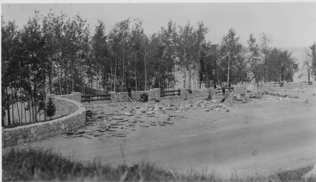
Orr Picnic Area Camp S-52 Cusson, Minn.