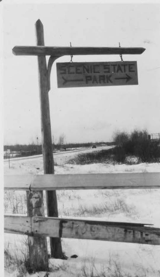
U.S. Park Service Type