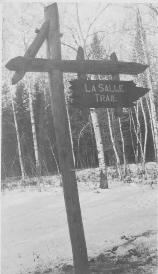
Sign Itasca Park