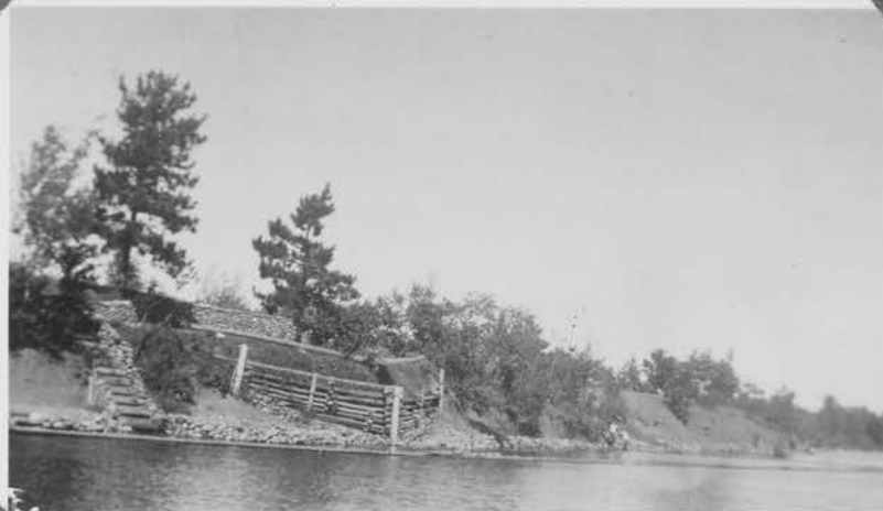
Island Lake Public Camp Camp S-51