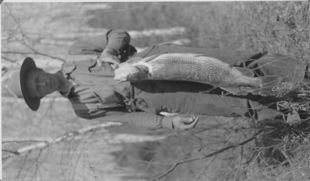
13 lb Pickeral found on shore Antler Lake, Camp S-54