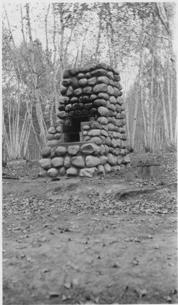
Fire place at Beatrice Lake Camp ground. By Camp S-53, Side Lake, Minn. Sept. 29, 1938