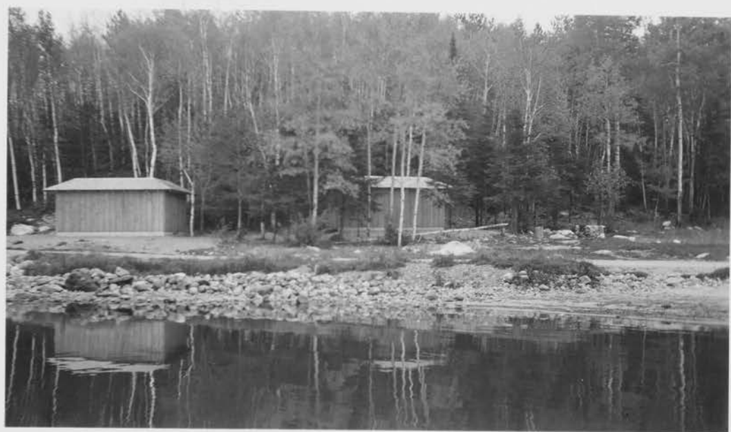
Bathhouses, Wakemup Bay Camp Site. Lake Vermilion, Dec. 36.-63-18. By. ccc Camp 5-52 Curzon, Minn. Sept. 29, 1938