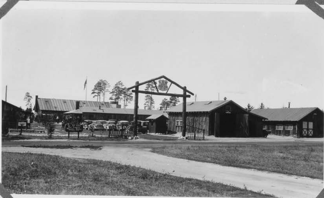
Camp S-53 Side Rock