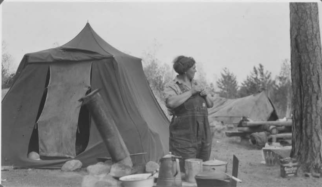
Public Camp Ground Campers E.C.W. Recreational Developments