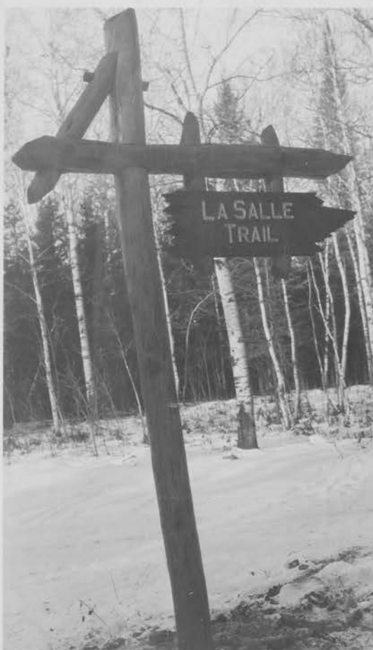
Sign - Itasca State Park