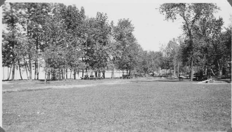
Sod Lawn Orr Camp Ground