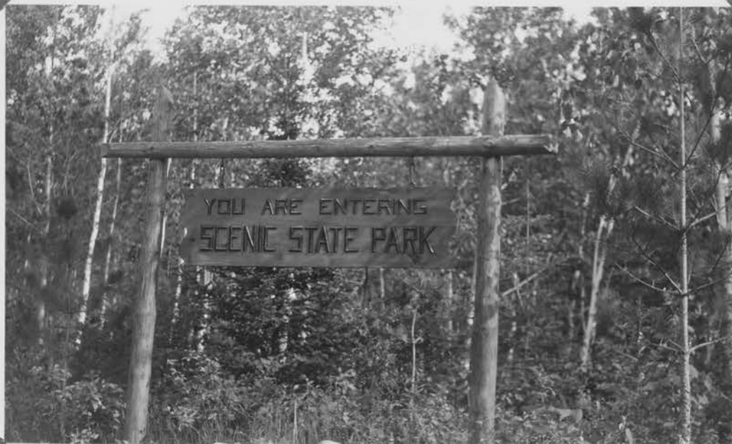
Typical Signs - U.S. Park Service.